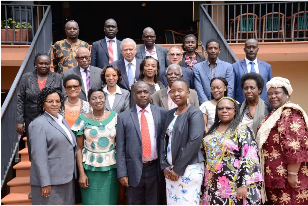
Second retreat of the Committee of Elders in Uganda