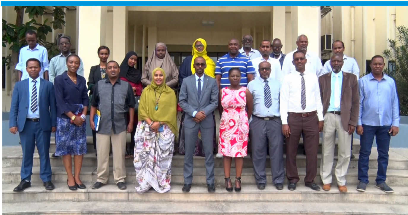
Participants at the Djibouti National Workshop on Simplified Trade Regime

COMESA has developed a draft Action Plan to be used by Djibouti in the implementation of the Simplified Trade Regime (STR) with its neighbouring Member States. The Draft National Road Map and Action Matrix is set for consideration by senior management officials in their respective ministries, institutions and administration before it is implemented.