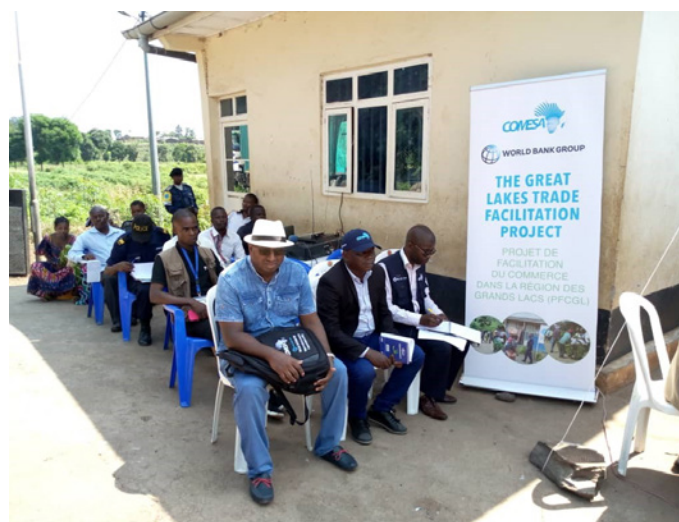
Trade Information Desk Officers and DRC Government officials at the launch of Kamanyola border post Trade Information Desk