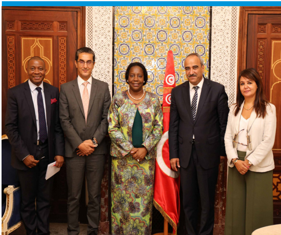
File Photo: COMESA delegation and Tunisia government team meeting in Tunis, September 2019

Tunisia can now export its products to 15 member States of the COMESA Free Trade Area without paying import duties after completing the process of developing and issuing the legal instruments for trading.