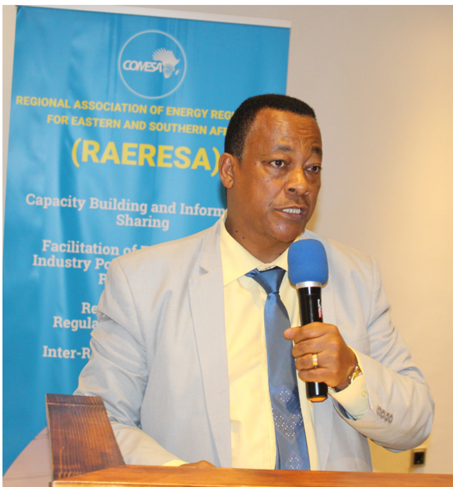
Ethiopian State Minister of Water, Irrigation and Energy Dr. Frehiwot Woldehana

Thermal power accounts for 69% of the total installed power generation capacity in the COMESA region which is currently estimated at 92,000 megawatts (MW) with hydro power, (large and small) taking 30 share.