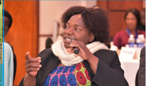
COMESA Change Management Training