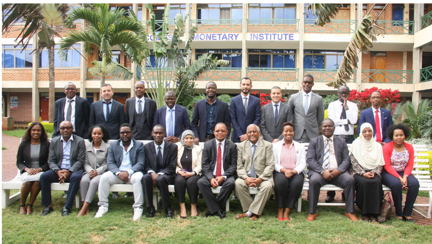
Experts from COMESA Central Banks at the validation workshop on DSGE modeling

COMESA Monetary Institute has developed a User's Guide on the Basic Dynamic Stochastic General Equilibrium (DSGE) Modelling and Forecasting for Monetary Policy Formulation. DSGE is an economic tool kit or method used by economists to explain the working of the economy from micro-economic principles (foundations). The tool kit models interactions of household, firms, government and external sector behaviour, such as agents that constitute the economy, to inform economic policy.