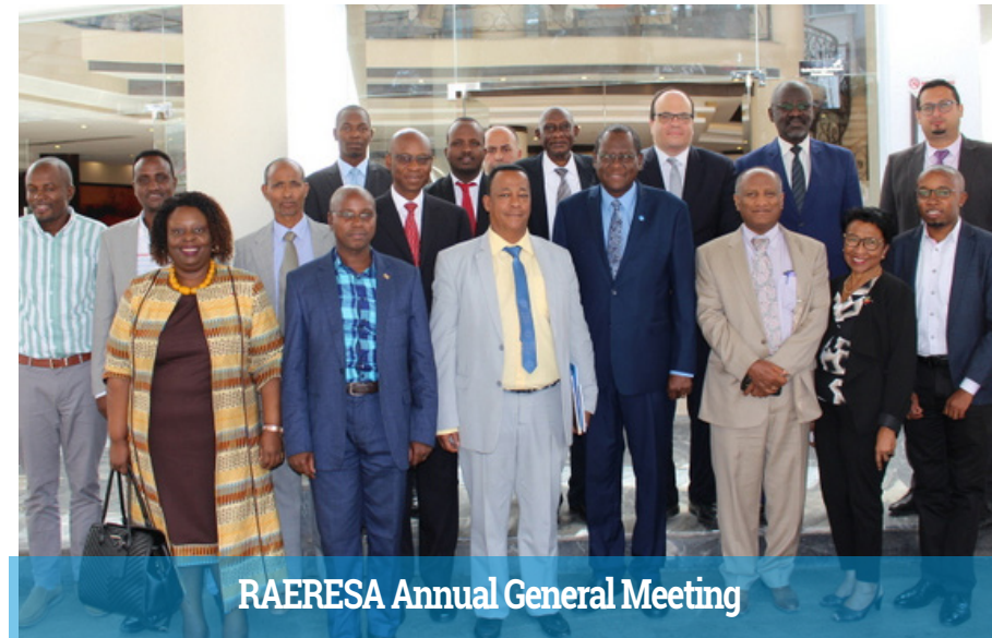
RAERESA Annual General Meeting