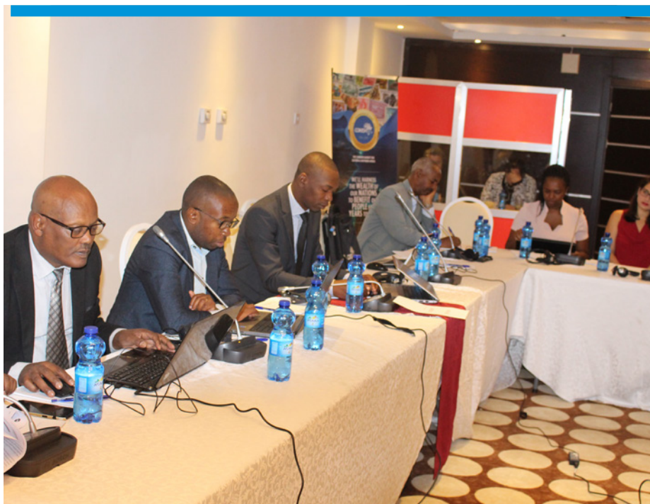
Energy experts representing energy regulatory authorities at the 9th RAERESA AGM in Addis Ababa

Energy regulatory authorities in countries that are members of the COMESA Regional Association of Energy Regulators for Eastern and Southern Africa (RAERESA) will be going through peer review to ensure their operations are benchmarked against regional best practices.