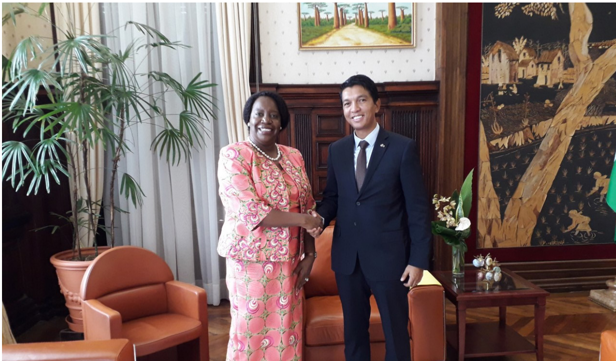
H. E. President Andry Rajoelina welcoming COMESA Secretary General Chileshe Mpundu Kapwepwe

2019 Summit and Policy Organs Meetings on the Agenda