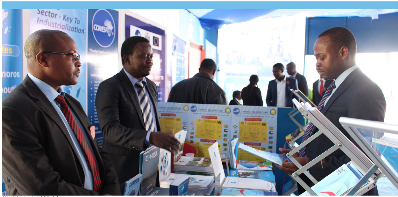
COMESA booth at the Ndola Trade fair.