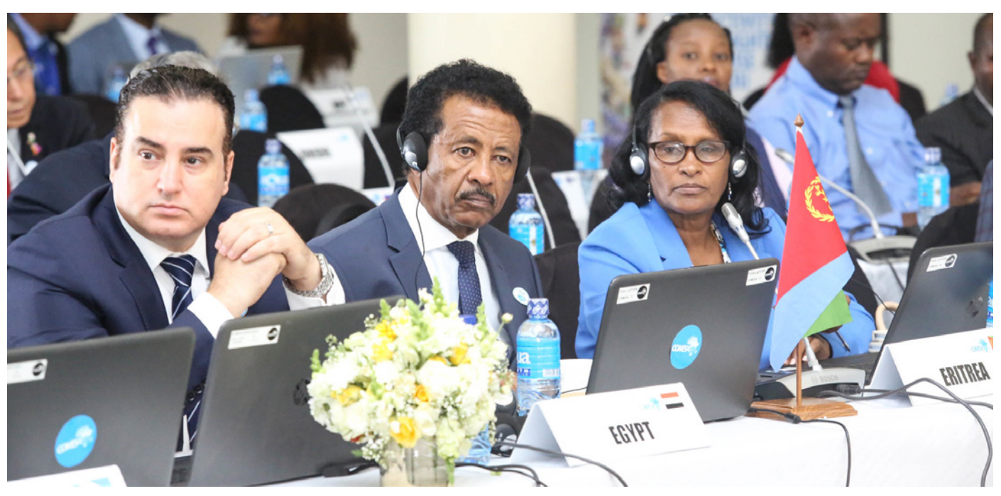
The 40th COMESA Council of Ministers meeting in session

he 40th COMESA Council of Ministers meeting took place in Lusaka on Friday 29th November marking the culmination of one week of activities to commemorate the organization's Silver Jubilee.