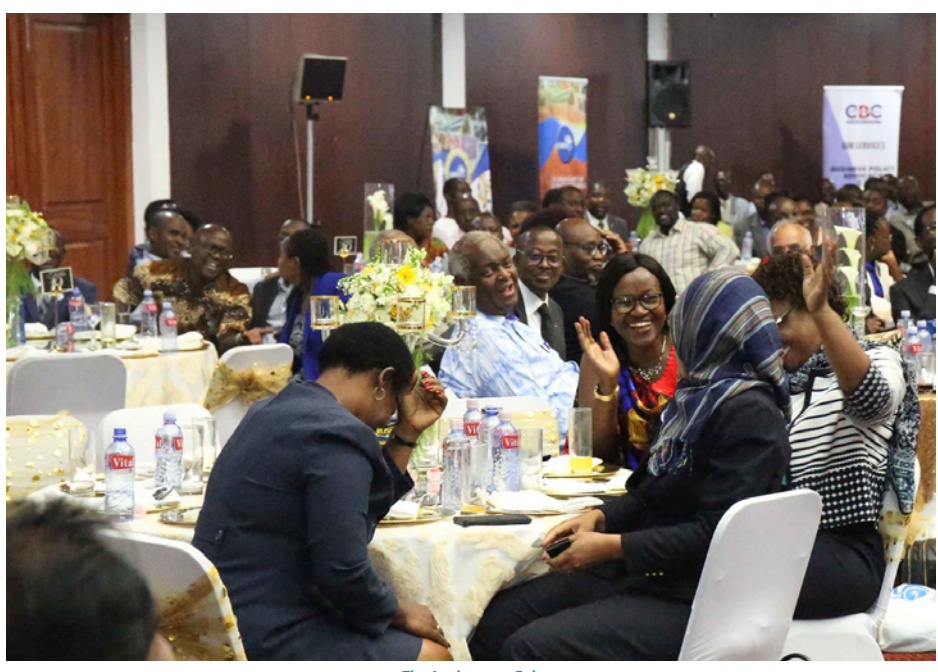
The Anniversary Gala

he Common Market for Eastern and Southern Africa – COMESA, celebrated 25 years since it was established in 1994 to succeed the Preferential Trade Area (PTA), on Friday 28 November 2019.