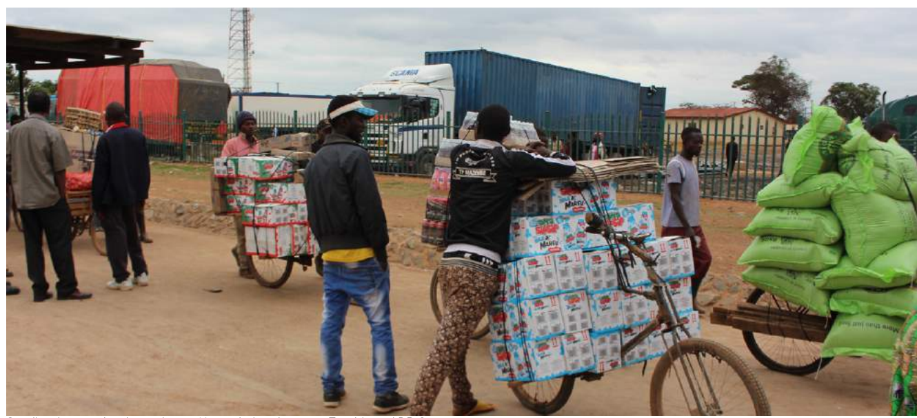
Smallscale cross border traders at Kasumbalesa between Zambia and DR Congo

ack of market infrastructure near borders reduces the connection between traders and customers. In addition, poor quality, or absence of storage facilities often result in traders selling perishable stock at losses to prevent spoilage. Women cross border traders who deal primarily with low value, perishable primary products are particularly susceptible to this occurrence. This is clearly not conducive environment to have a competitive business.