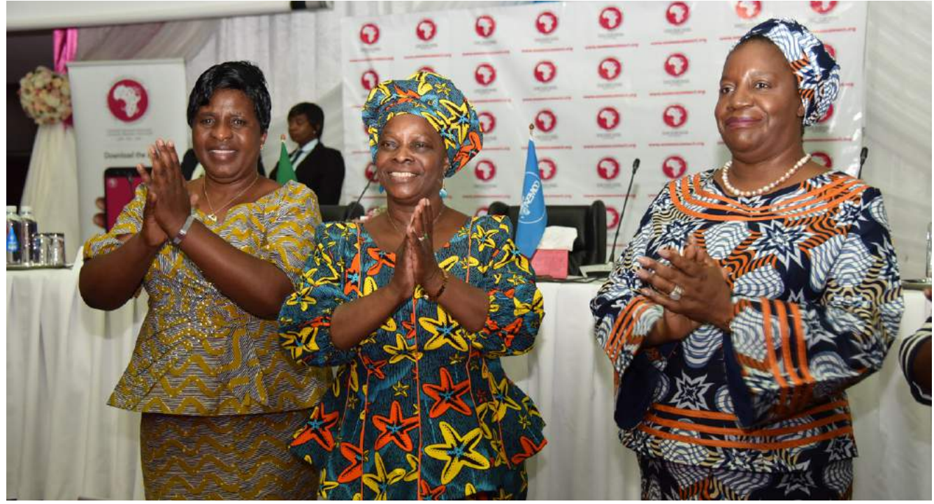
Zambia First lady Mrs. Esther Lungu (middle) launches the 50MAWSP flanked by COMESA SG Chileshe Kapwepwe (R) and Zambia Minister of Gender Ms. Elizabeth Phiri.

n online business networking platform aimed at connecting 50 million women entrepreneurs across Africa was launched in Zambia on 28 February 2020. This was the inaugural national launch, with others planned to be rolled out in 38 countries that are members of the Common Market for Eastern and Southern Africa (COMESA), the East African Community (EAC) and the Economic Community of West African States (ECOWAS).