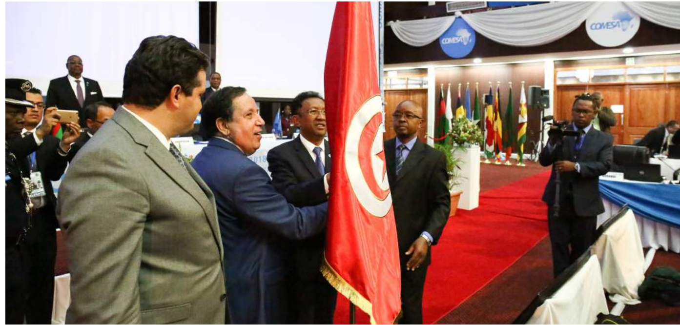
File Photo: Tunisia joining COMESA, July 2018

In less than two years since Tunisia joined COMESA, the country has actively embarked on activities to integrate its economy into the regional market and benefit from wide market access of over 560 million people. But unlike the common trend where countries liberalize their market in measured steps, some running into decades, Tunisia has done it in a record time.