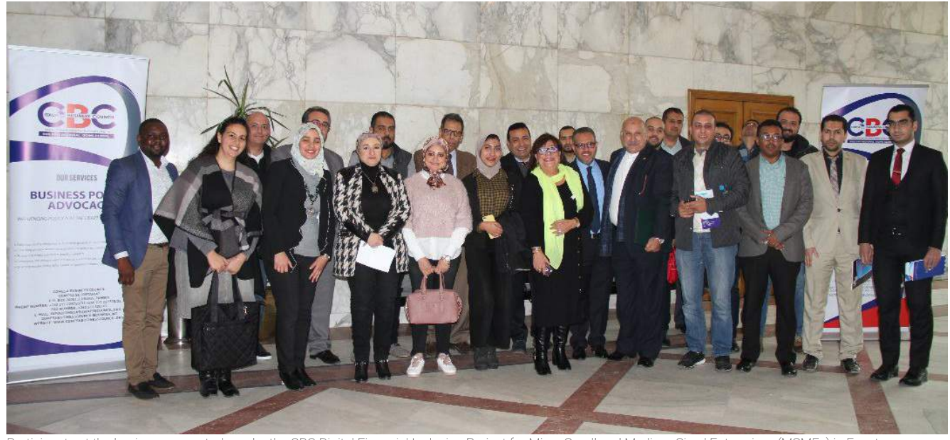
Participants at the business case study under the CBC Digital Financial Inclusion Project for Micro Small and Medium-Sized Enterprises (MSMEs) in Egypt.

The COMESA Business Council is lobbying Micro, Small and Medium Enterprises (MSMES) to embrace digital finance in their day to day running of business transactions as this will ease trade facilitation. Pursuant to this objective, CBC has been conducting a business case study under its Digital Financial Inclusion Project for MSMEs.