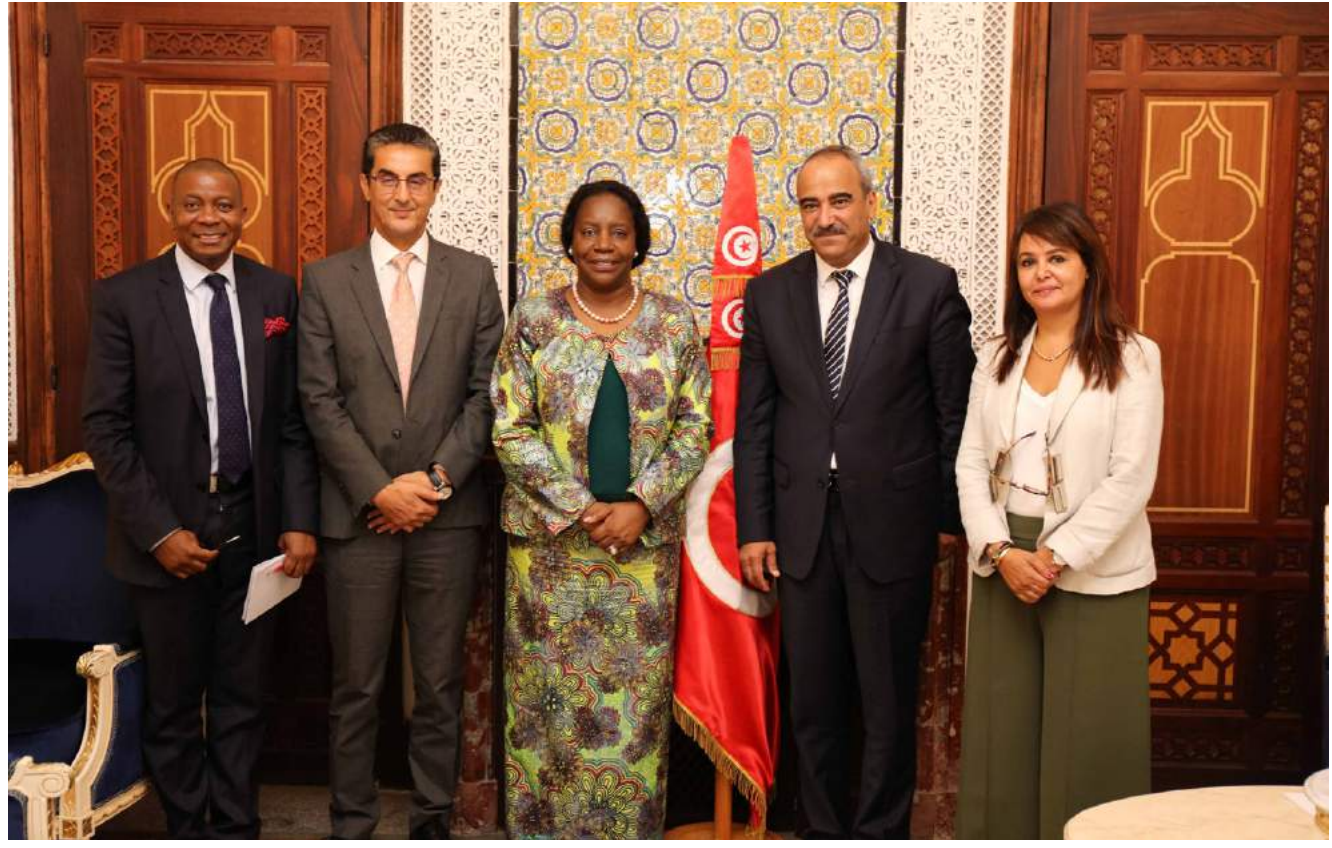
File Photo: COMESA delegation and Tunisia government team meeting in Tunis, September 2019

Tunisia can now export its products to 15 member States of the COMESA Free Trade Area without paying import duties after completing the process of developing and issuing the legal instruments for trading.