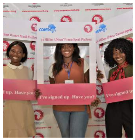
Young women attending the national launch of 50MAWSP in Zambia

In COMESA Member States, the platform will ride on the trade facilitation tools that have already been developed and removal of restrictions to trade