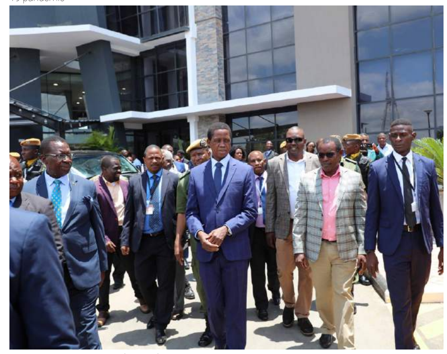
President Edgar Lungu tours the facility before the opening ceremony in December 2019

The Zep-Re building was opened in December 2019 by the Zambian President H.E Edgar Chagwa Lungu.