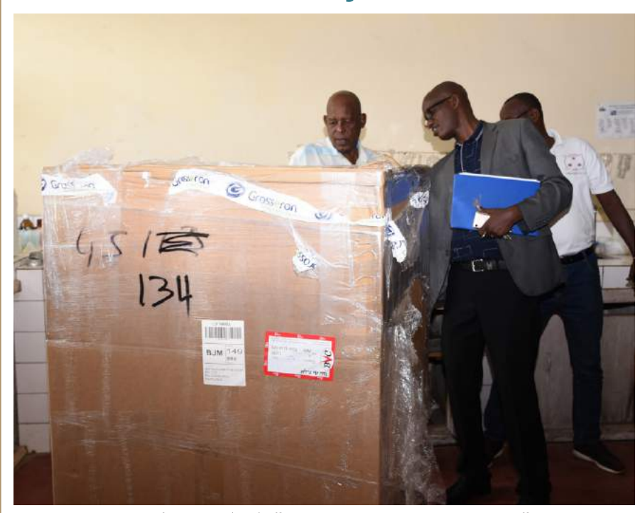
Burundi Bureau of Standards (BBN) officials inspect the new equipment at their offices in Bujumbura

The Burundi National Bureau of Standards (BBN) received equipment worth €150,000 to support its operations and improve regional market access for Burundi products. The supply, which arrived in Bujumbura on 1 March 2020, included laboratory equipment for building materials, metrology, electrical and plastic, chemistry, microbiology and field vehicles. Under the same package, staff that will use the equipment were trained in advance.