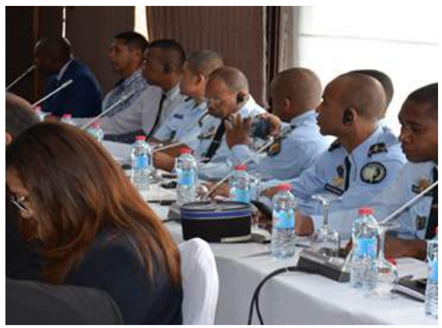
Madagascar Law Enforcement Agencies in training

OMESA Maritime Security (MASE) programme has trained 54 law enforcement personnel to strengthen the country's and the regional capacity to fight money laundering and terrorism financing. They include magistrates, prosecutors, police/gendarmerie, officials from financial intelligence unit, anti-corruption commission, central intelligence services, among others.