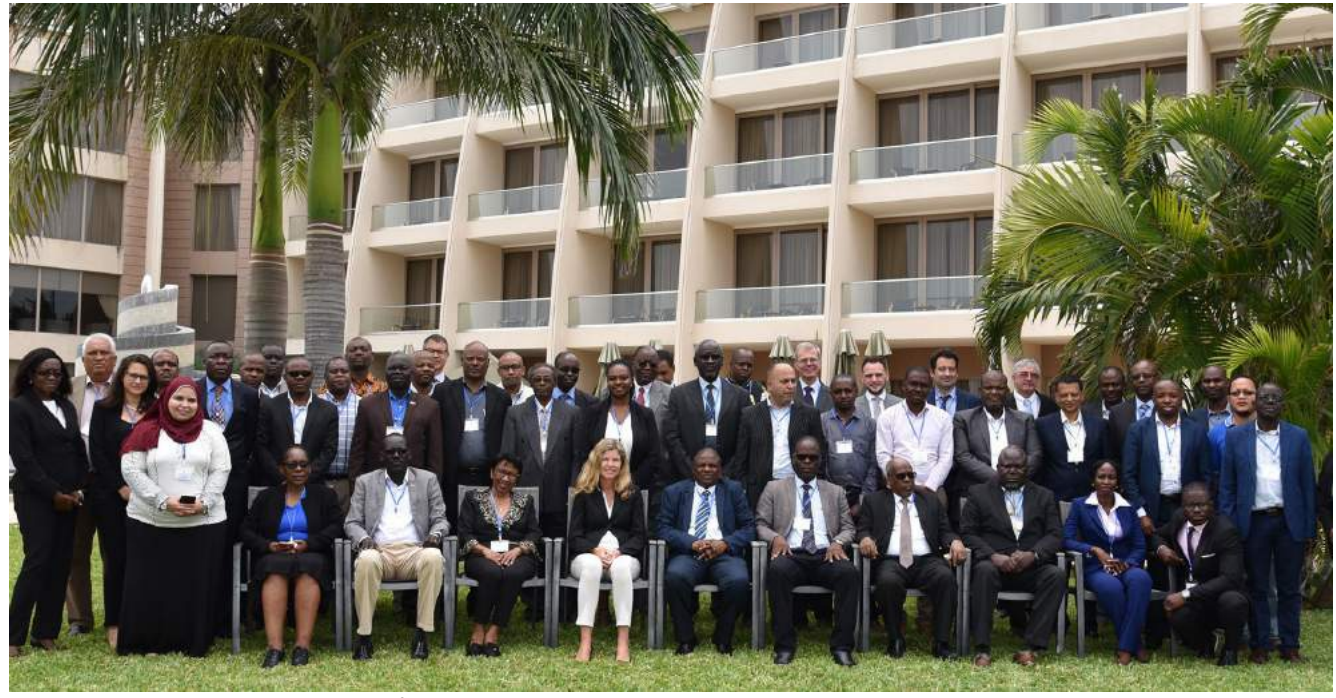
Delegates at the regional consultative workshop for energy regulatory authorities

The COMESA Regional Association of Energy Regulators for Eastern and Southern Africa (RAERESA) is developing a regulatory oversight framework for electricity sector in the region. The framework is expected to enhance the efficiency of regional power trading on the continent.