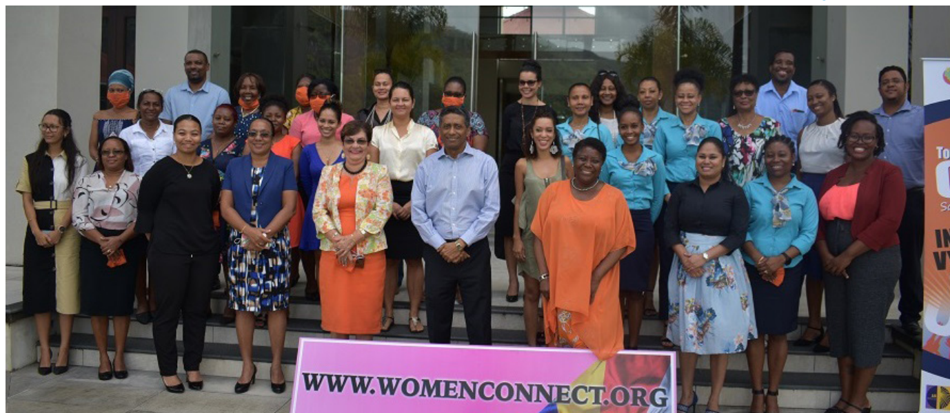
President Danny Faure (centre in blue shirt) participated in the launch

The 50 Million African Women Speak (50MAWSP) platform was on Tuesday 25 August unveiled in Seychelles with the country's President His Excellency Danny Faure urging women to seize the opportunities it will present them to do business. The launch was the first in a COMESA Member State since the onset of the COVID-19 pandemic and was held through a hybrid arrangement where a limited number of local participants gathered physically and were joined virtually by several invited guests.