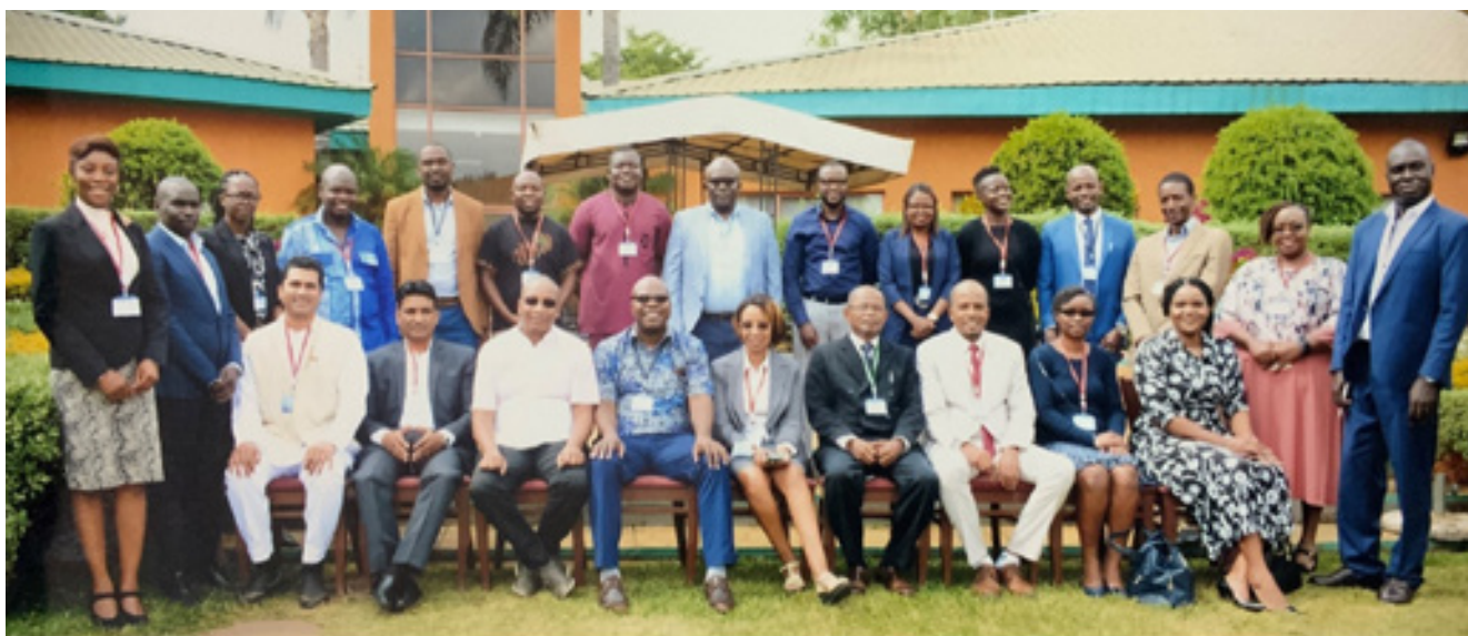
Delegates attending the COMESA-AU-CSO Symposium in Malawi

The framework will enable the parties to analyse data and information for conflict prevention, peace building and conflict management in the region and beyond