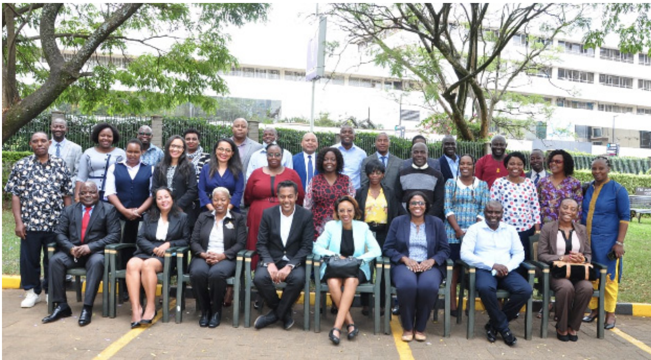
Participants at the Joint AU/COMESA Training of Trainers Workshop Kenya

In a programme meant to assist countries to have a structured system to prevent conflicts while promoting the consolidation of peace, 26 officials from five COMESA/AU Member States were trained on methodologies to support the building of resilience in Member States. These include the COMESA Structural Vulnerability Assessments (SVAs) and the African Union Country Structural Vulnerability and Resilience Assessment (CSVRA).