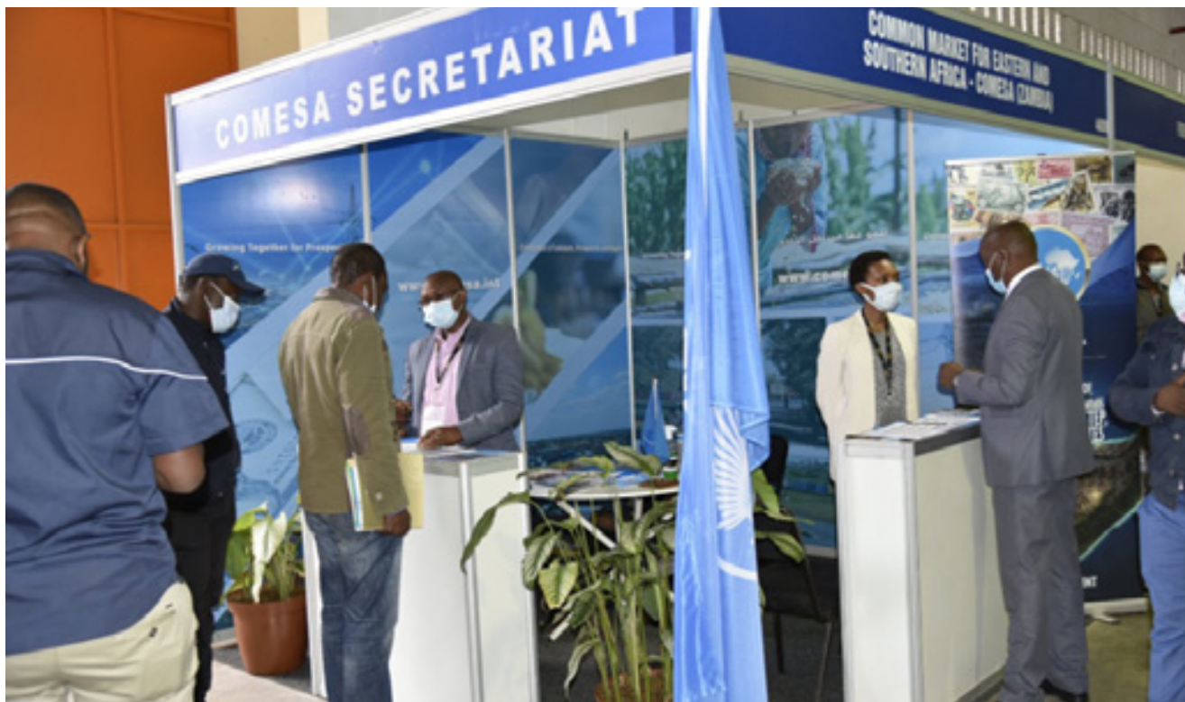
COMESA staff engage with the public at the Zimbabwe International Trade Fair