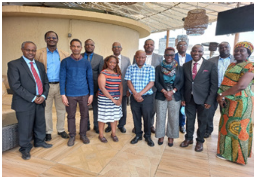
Members of the AU Seed and Biotechnology Working Group