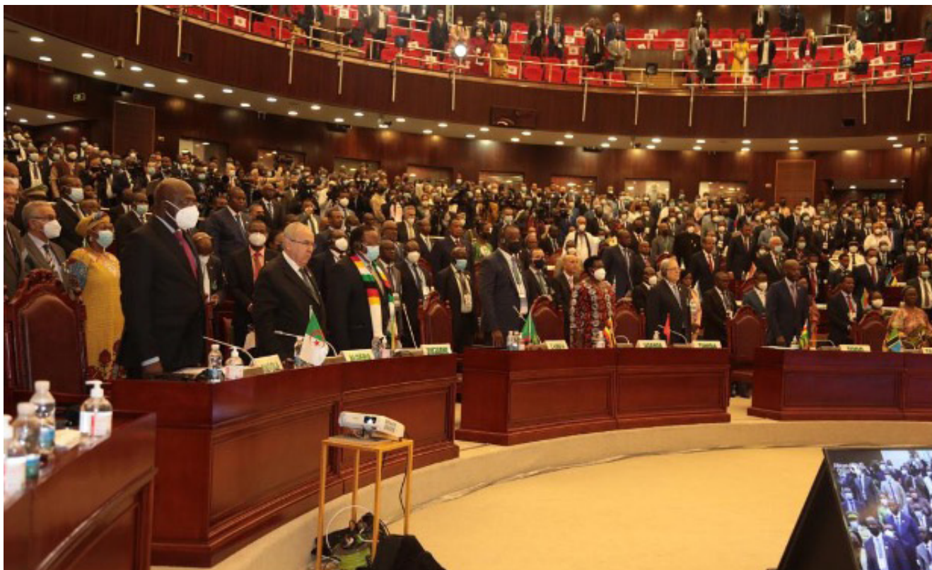
The 16th Extraordinary Session of the Assembly of Heads of State and Governments of the African Union