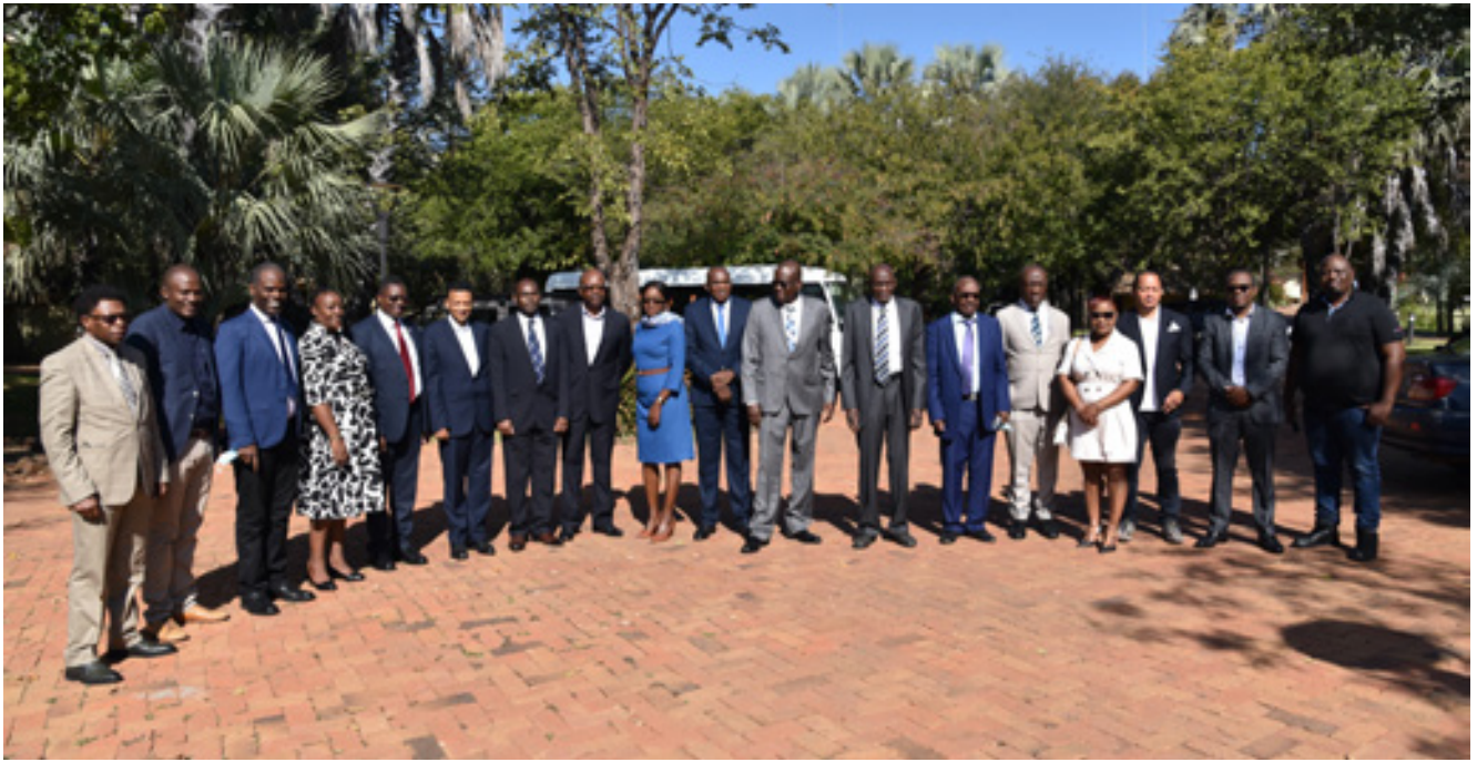
Members of the ESREM PTSC during the project closure meeting in Livingstone