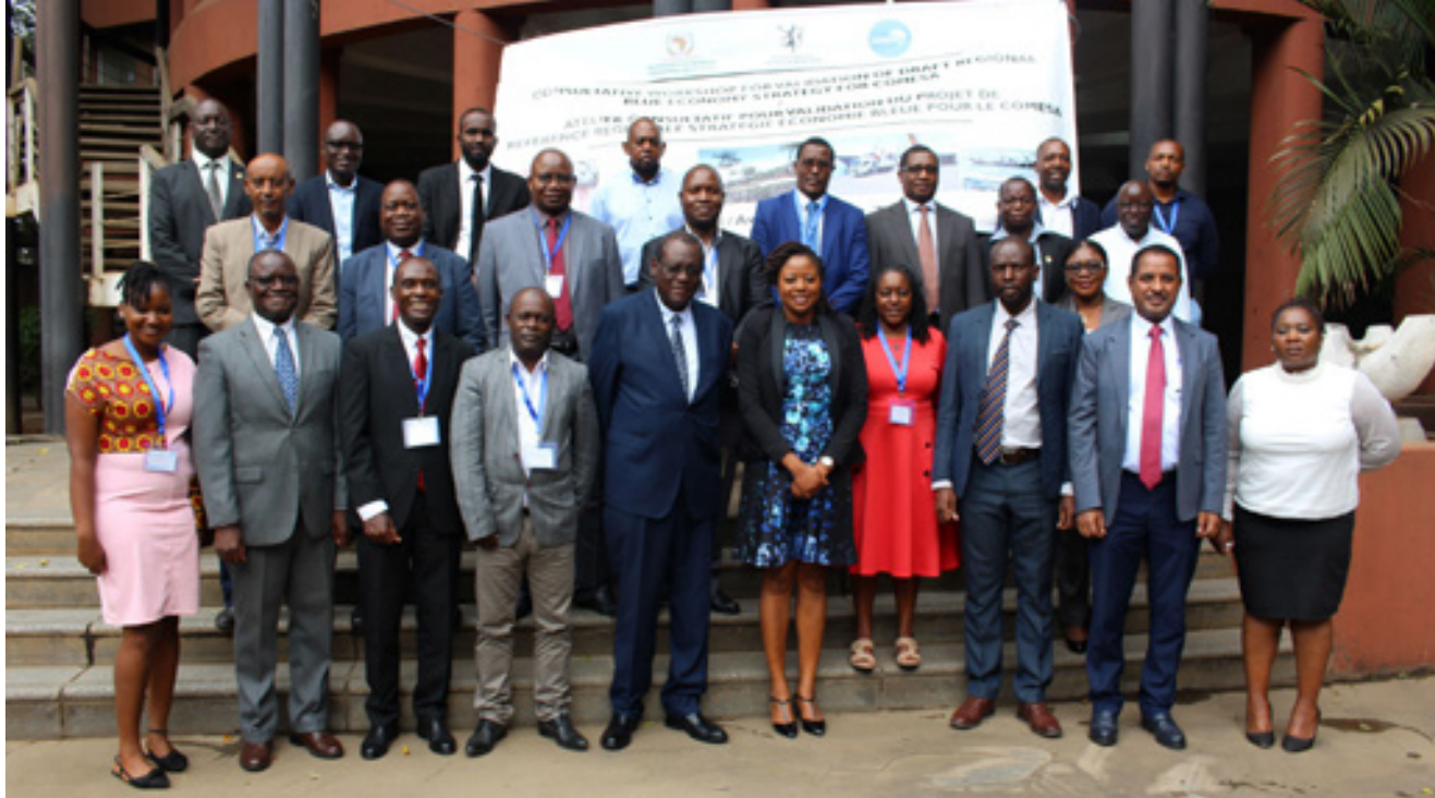
Delegates at the validation workshop of the COMESA Blue Economy strategy