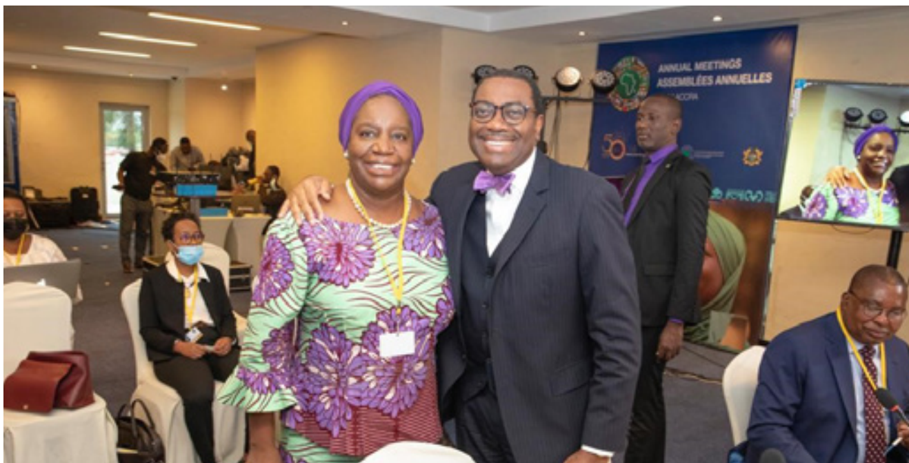
COMESA Secretary General Chileshe Kapwepwe (L) and the AfDB President Dr Akinwumi Adesina at the AfDB Annual meetings in Ghana