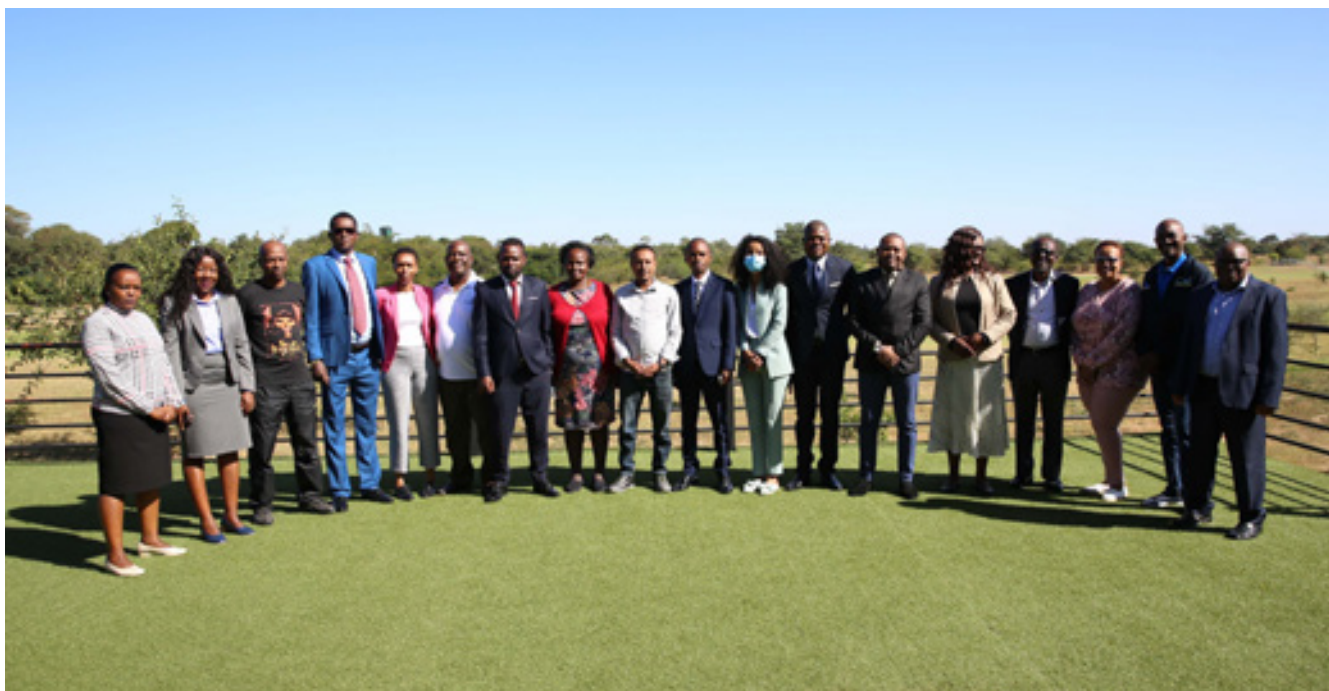
Delegates participating in the TRIST training in Lusaka