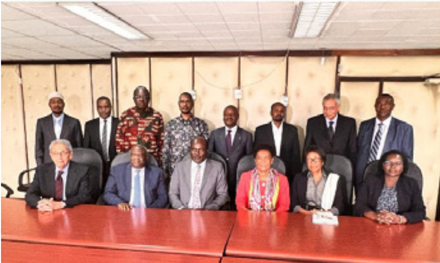
The AU, COMESA and EAC Team with Commissioners of the Independent Electoral and Boundaries Commission in Kenya