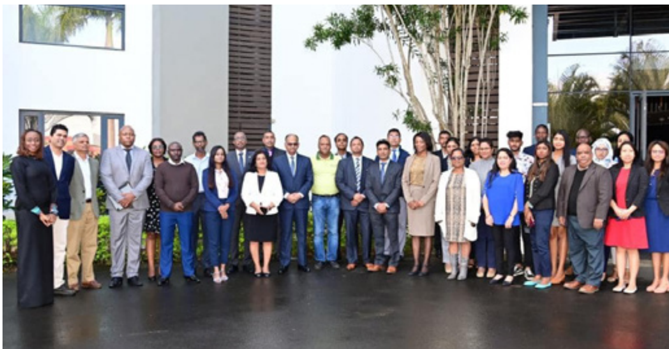
Delegates at the national consultations on COMWARN in Mauritius