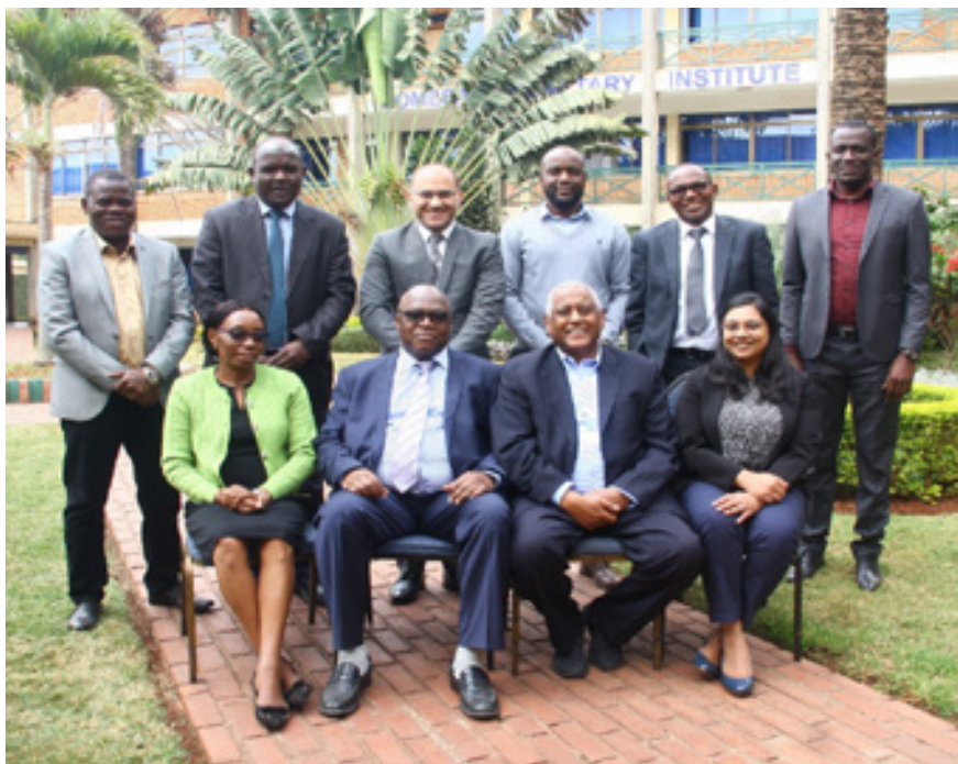
Officials of regional Central Banks and COMESA Monetary Institute attending the first working group meeting