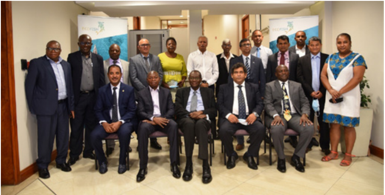
ECOFISH steering Committee members at Hilton hotel in Lusaka during the 3rd Programme Steering Committee