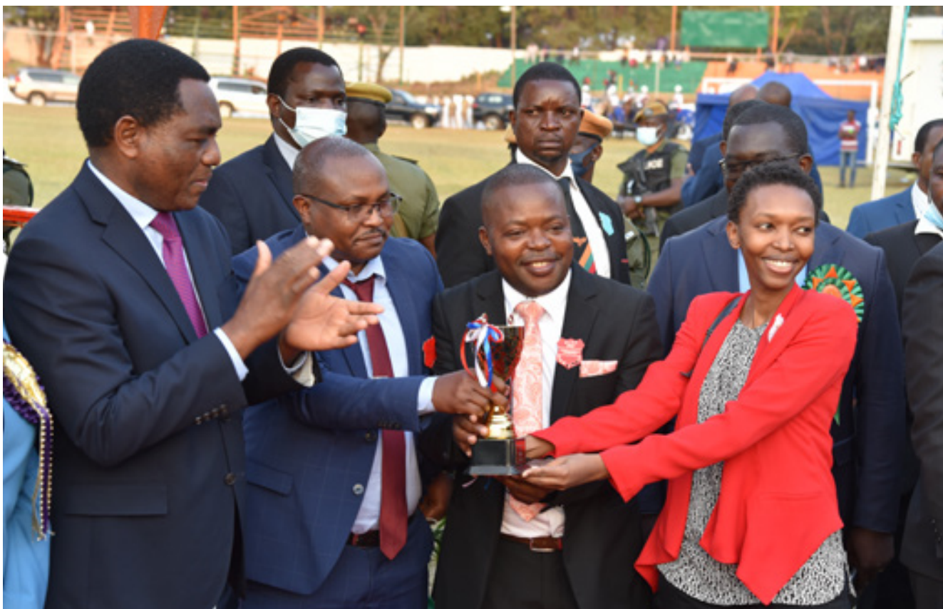
Zambia President H.E. Hakainde Hichilema (left) cheers the COMESA team after presenting the winning trophy at the Zambia International Trade Fair.