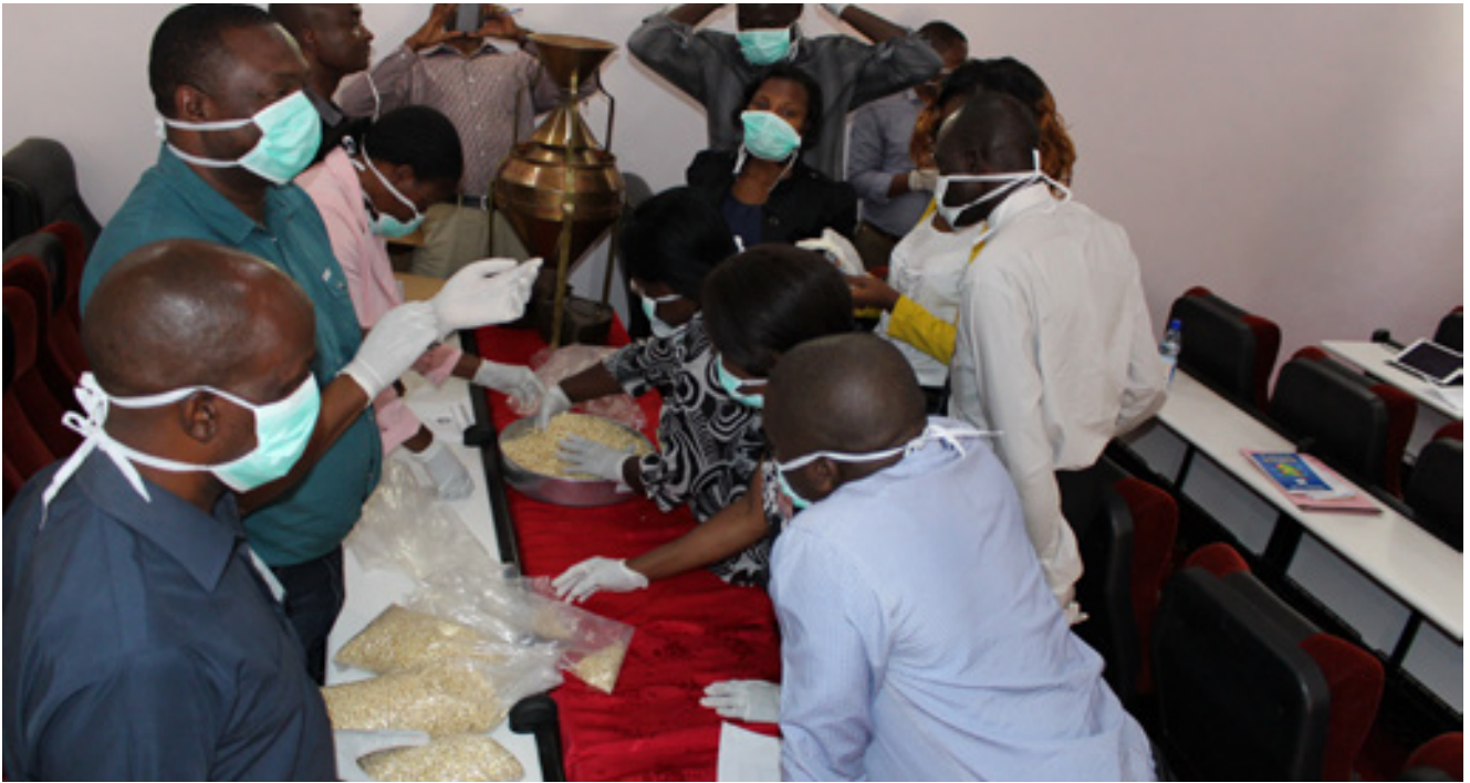
Quality testing for grains