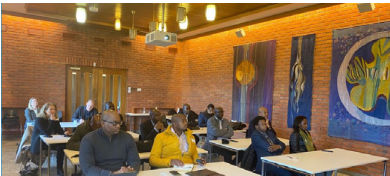
Regional Energy Experts Visiting the Nord Pool