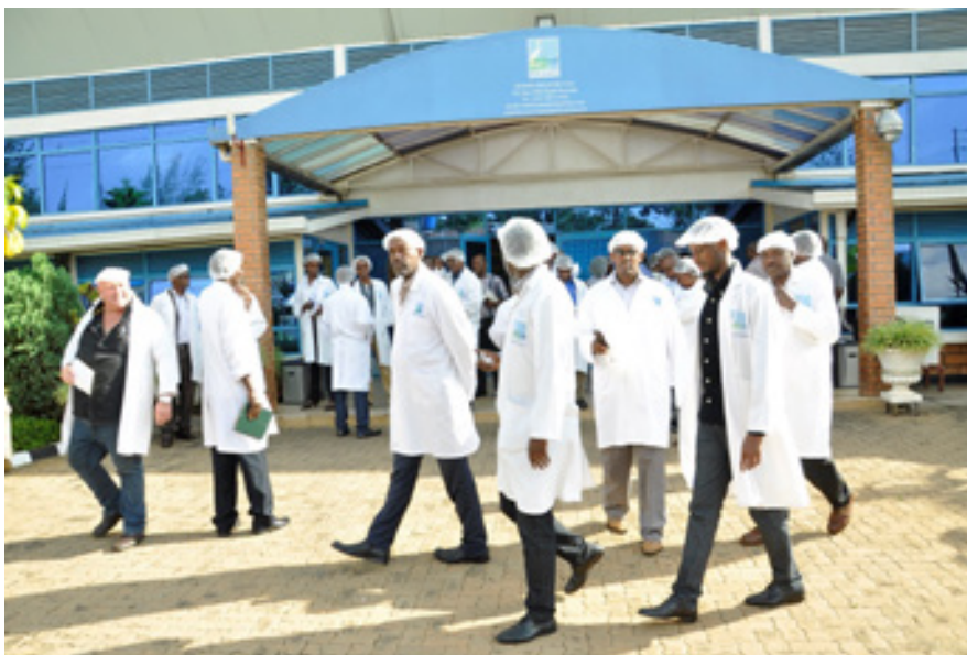
File photo: A section of regional business community members on a industrial visit to Rwanda