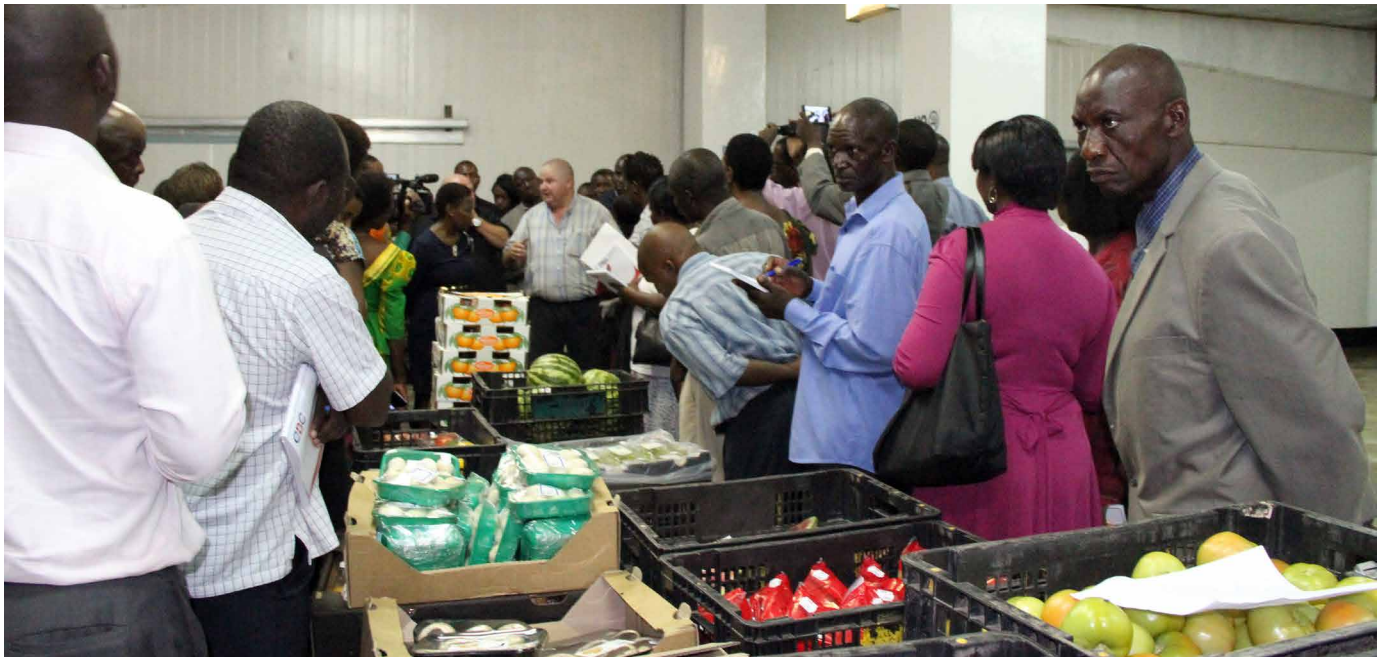
File photo/ Small scale Zambian entrepreneurs visiting Rosebloom agro-industry in Zambia. The study tour was organized by CBC under the Local Sourcing for Partnership programme.

Over 50 Small and Medium size Enterprises (SMEs) drawn from various sectors across Zambia participated in a two-day virtual training on capacity building organized by the COMESA Business Council (CBC). Participants were drawn from horticulture sector, meat, dairy and other agro-food industries. The objective was to enable the SMEs to meet the demands of the current urban African consumers and improve the current low rates of local sourcing and consumption of home-grown products.