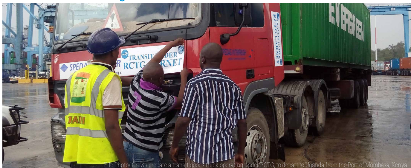
Crews prepare a transit goods truck operating under RCTG, to depart to Uganda from the Port of Mombasa, Kenya

The COMESA Regional Customs Transit Guarantee Scheme (RCTG-Carnet) has launched a Mobile Application to provide access to real-time information to clearing and forwarding agents in the region. The Application is accessible on Google Play Store and Apple Store and provides a one-stop shop for the agents in member countries to view current bond balance and active Carnets, get notifications on Carnet acquittals and expiry of RCTG Bonds.