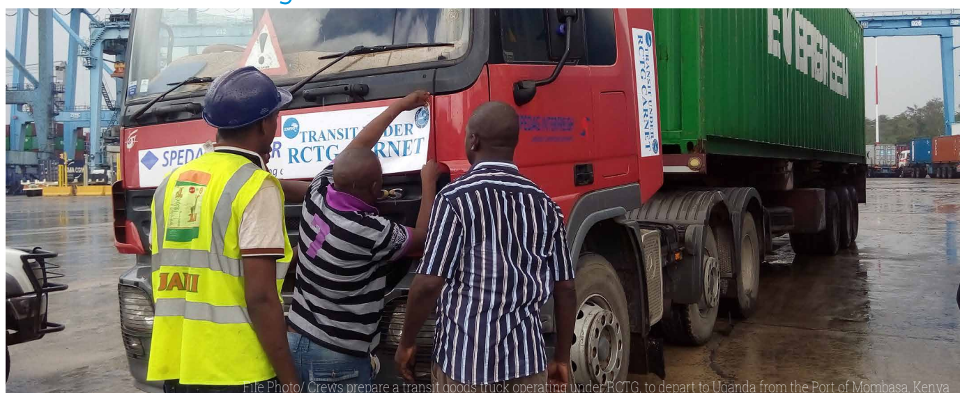
File Photo/ Crews prepare a transit goods truck operating under RCTG, to depart to Uganda from the Port of Mombasa, Kenya

The COMESA Regional Customs Transit Guarantee Scheme (RCTG-Carnet) has launched a Mobile Application to provide access to real-time information to clearing and forwarding agents in the region. The Application is accessible on Google Play Store and Apple Store and provides a one-stop shop for the agents in member countries to view current bond balance and active Carnets, get notifications on Carnet acquittals and expiry of RCTG Bonds.