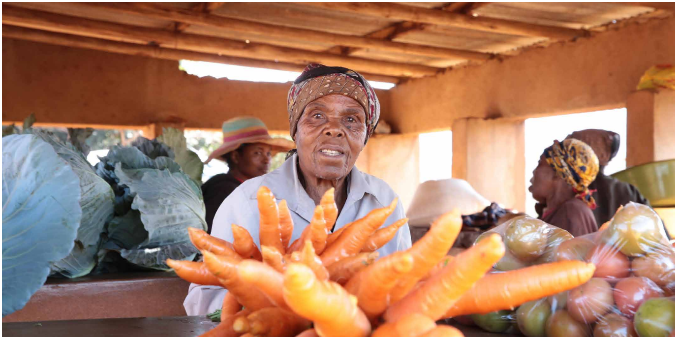
Small scale Eswatini farmer displays her agricultural produce

The government of Eswatini has developed a national Roadmap for the implementation of the COMESA Simplified Trade Regime (STR) as well as the Trade and Transportation Facilitation instruments for the Small-Scale Cross Border Traders (SSCBT). The Roadmap is under consideration by senior management in respective ministries and institutions in the country.