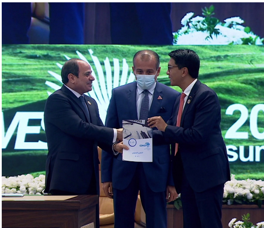
New COMESA Chair, President Abdel Fattah El Sisi (L) receives COMESA Annual Report from outgoing Chair President Andry Rajoelina.

Outgoing chairperson of COMESA, President Andry Rajoelina launched the 2020 COMESA Annual report which he handed over to his successor President Fattah El Sisi. The report outlines the achievements during the past year, which was characterized by the COVID-19 Pandemic and its aftermath.