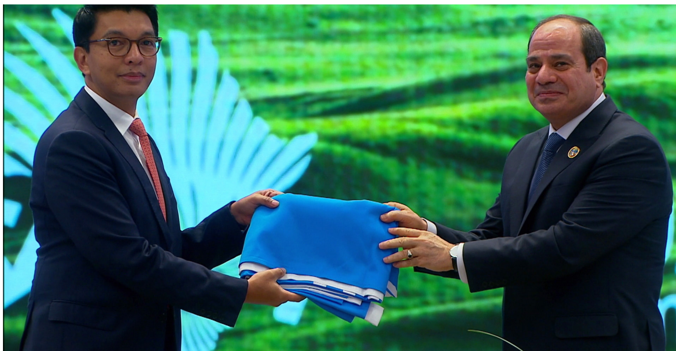
President Andry Rajoelina (L) hands over COMESA flag to President Abdel Fattah El Sisi

Egypt is the new Chair of COMESA after taking over from Madagascar, which has been steering the organization since 2016. President Abdel Fattah El Sisi took over from President Andry Rajoelina of Madagascar during the 21st Summit of the COMESA Authority of Heads of State and Governments on 23rd November in Cairo, Egypt.