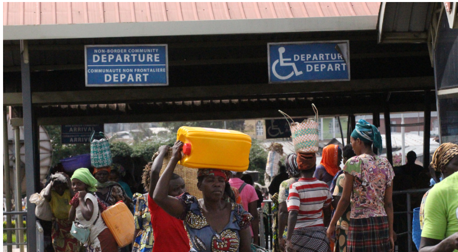
File: Rubavu/Goma on the Rwanda, DR Congo border

The Tripartite Sectoral Ministerial Committee for Trade, Customs, Finance, Economic Matters and Home/Internal Affairs has approved guidelines to facilitate the safe mass movement of persons and personal goods across the region while mitigating the spread of COVID-19.