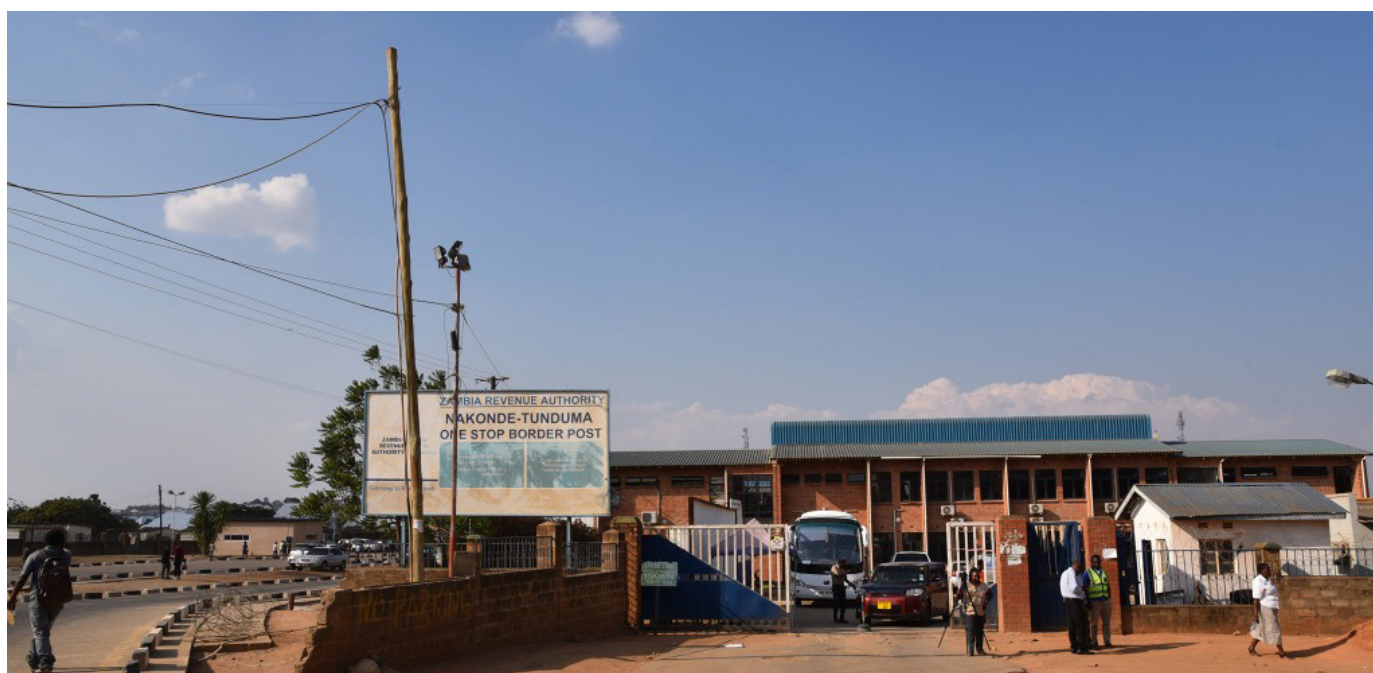
Nakonde border post