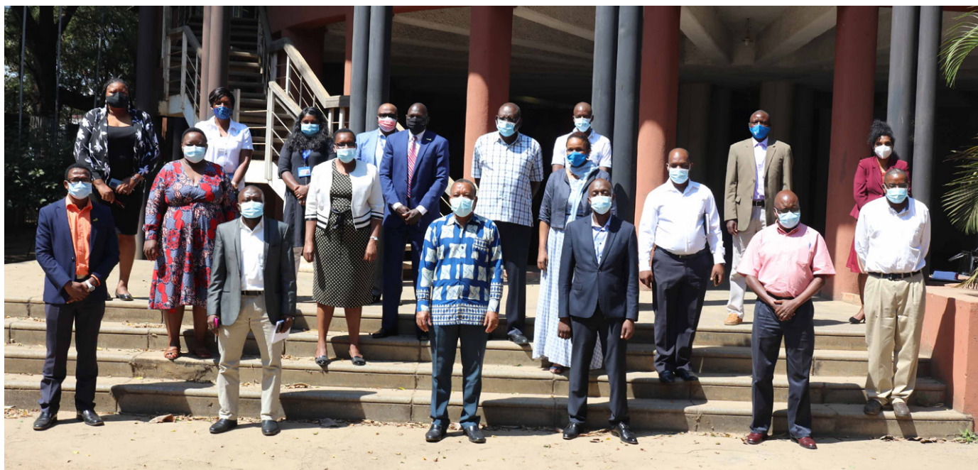
The COMESA COVID-19 Taskforce Team with the AU-CDC after their meeting at the COMESA Secretariat