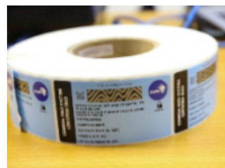
Figure 3: A roll of COMESA Seed Labels containing 2,000 Seed labels