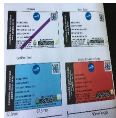
Figure 2: Four classes of the COMESA Seed Labels

Get more details on: https://varietycatalogue.comesa.int/login .