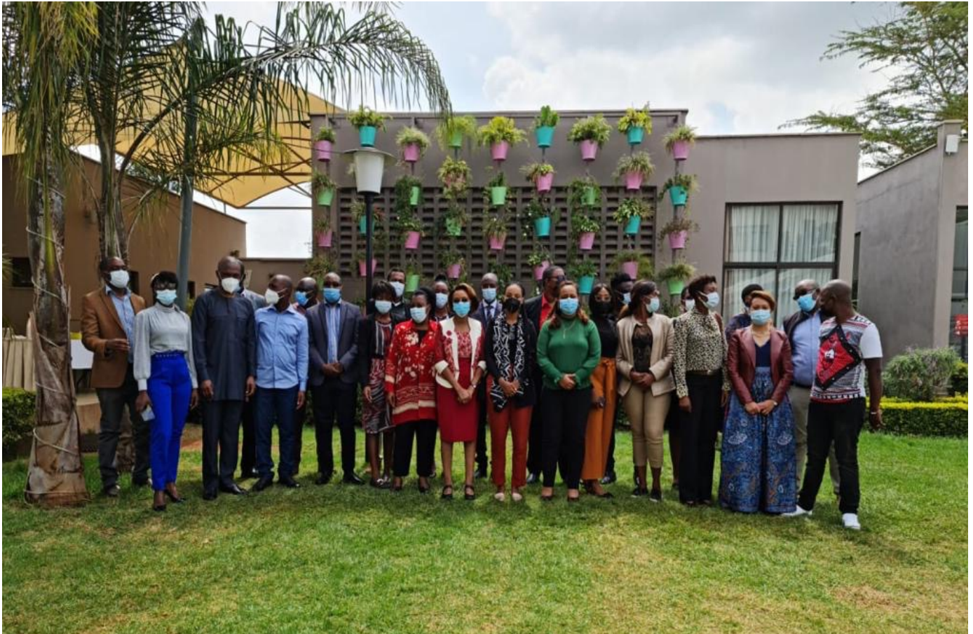
Participants at the Training of Trainers Workshop