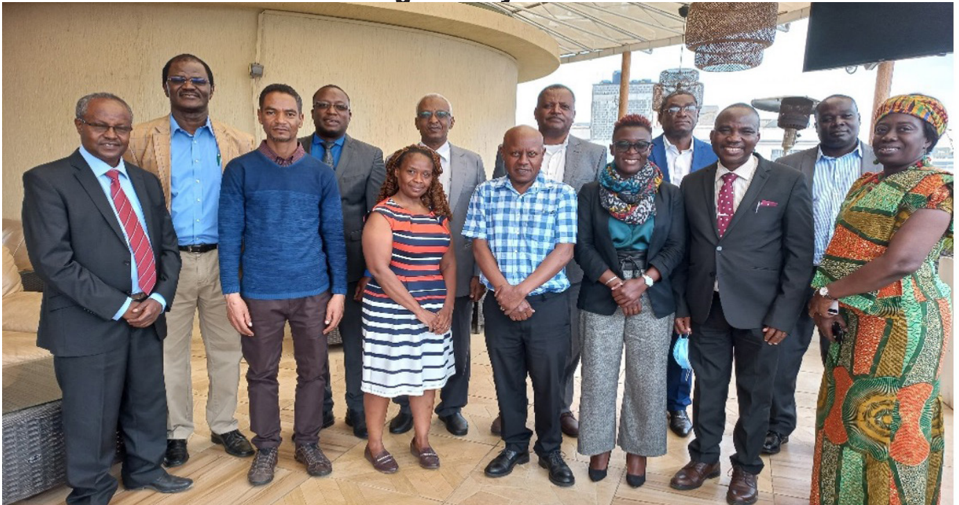
Members of the AU Seed and Biotechnology Working Group

With the launch of the African Continental Free Trade Agreement, Member States stand to benefit from wider market access for seed trade. This will lead to competitiveness of the seed industry and pricing given the ongoing efforts by the African Union Commission and partner organizations in seed policy and regulatory harmonization on the continent.