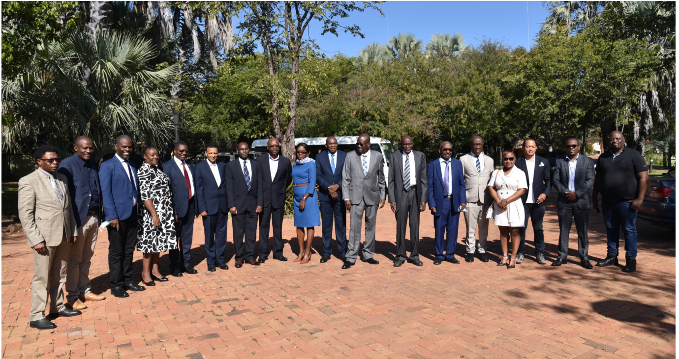
Members of the ESREM PTSC during the project closure meeting in Livingstone

The Enhancement for a Sustainable Regional Energy Market (ESREM) Project is closing on 30th May 2022 after being in operation for the past five years. Through the support of the European Union, the Project has endeavored to create a favorable regulatory environment and tools for regulatory oversight in the Eastern Africa -Southern Africa-Indian Ocean (EA-SA-IO) region. This is expected to stimulate increased power trading and bring a new horizon of cross border power trade opportunities for the countries in this region.