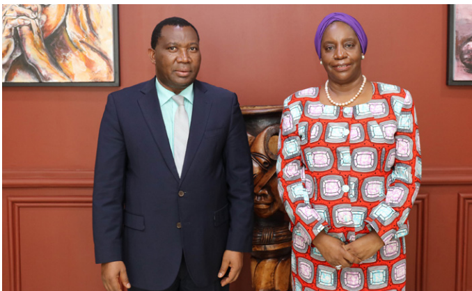
Secretary General Chileshe Kapwepwe (R) with the Minister of Finance Hon. Domitien Ndihoumbwayo