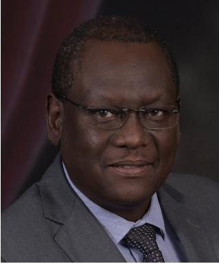
Amb. Kipyego Cheluget