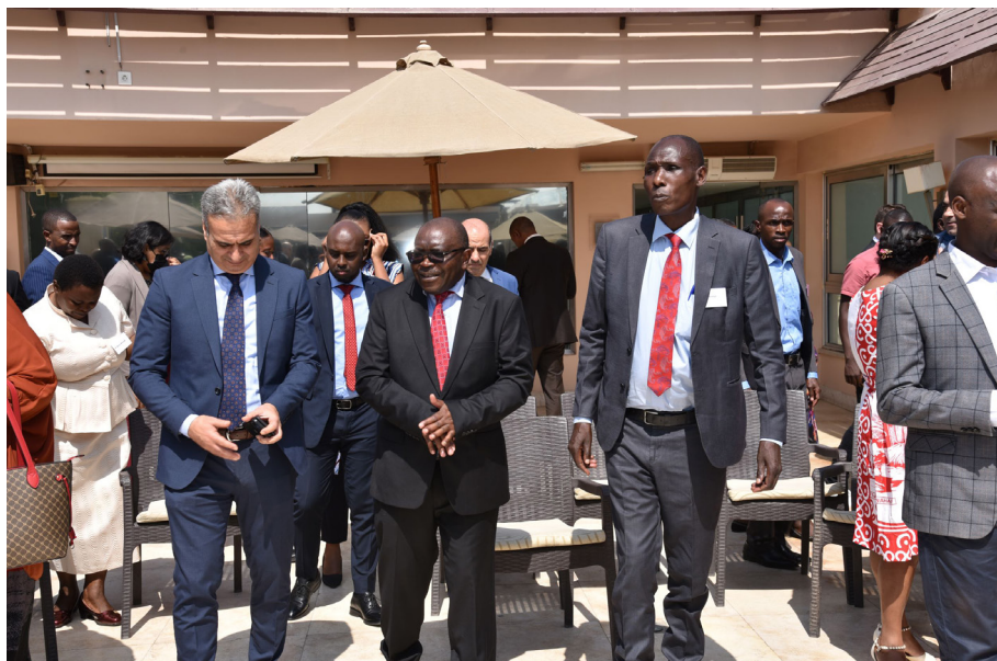
Participants at the Annual Research Forum

The forum was attended by close to 100 delegates from 19 Member States. Egyptian Assistant Minister for Economic Affairs Mr Ibrahim Seginy opened the forum and urged the use of research and engagement of various stakeholders – the academia, private sector and policy makers in government.