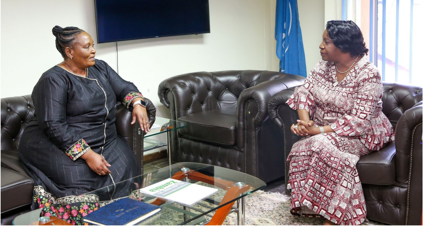
Left: Minister of Foreign Affairs and International Cooperation from Eswatini, Hon. Senator Thulisile Dladla with Secretary General Chileshe Mpundu Kapwepwe