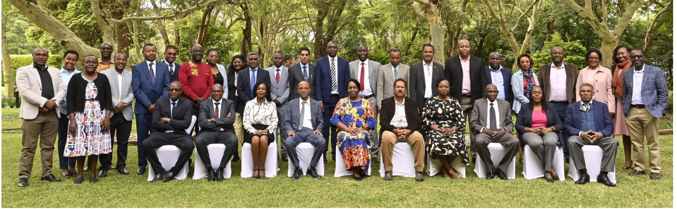
Participants at the COMESA Institutions CEOs 2nd Annual Retreat in Lusaka