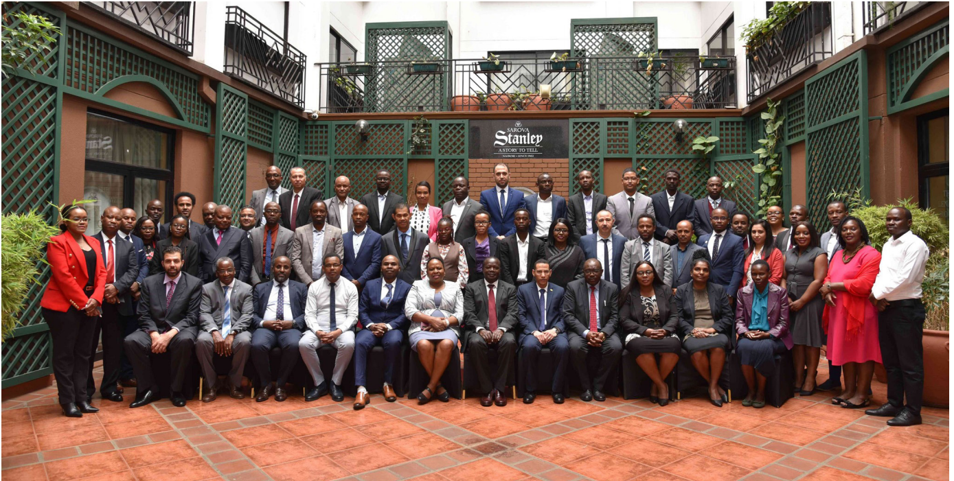
Participants in the Technical Working Group Meeting on the Electronic Single Window in Nairobi, Kenya