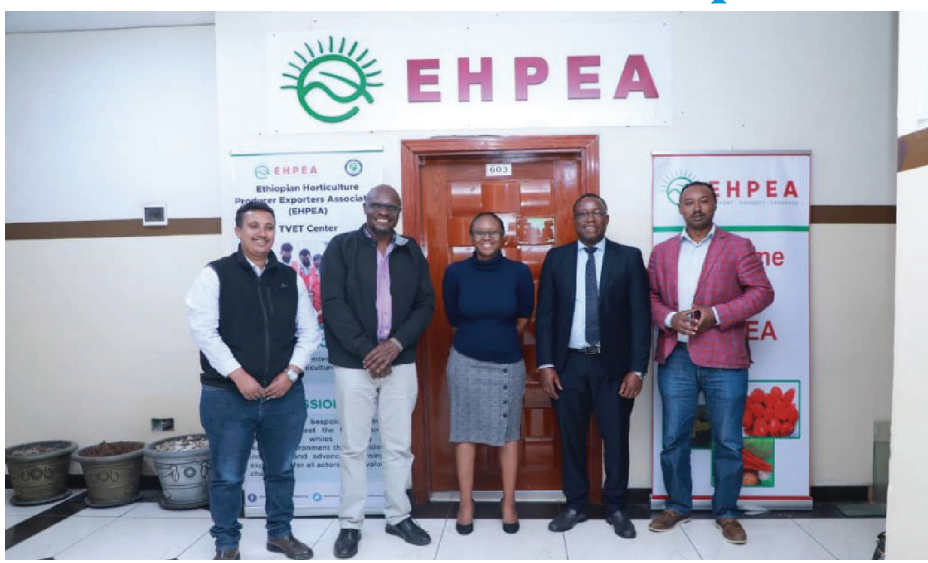
COMESA - EAC Horticulture Accelerator (CEHA) Project staff meeting with Ethiopian government officials in Addis Ababa

Research has shown that Ethiopia's horticulture sector is growing rapidly and is an important element in the country's efforts to diversify exports and contribute directly to poverty reduction. To ensure the continued growth of the sector through increased, exports, income employment, and food security, the Ethiopian Ministry for Agriculture and Horticulture Development Sector, is collaborating with the COMESA – East African Community Horticulture Accelerator (CEHA) Project in enhancing growth of the Horticulture Sector in Eastern and Southern Africa.