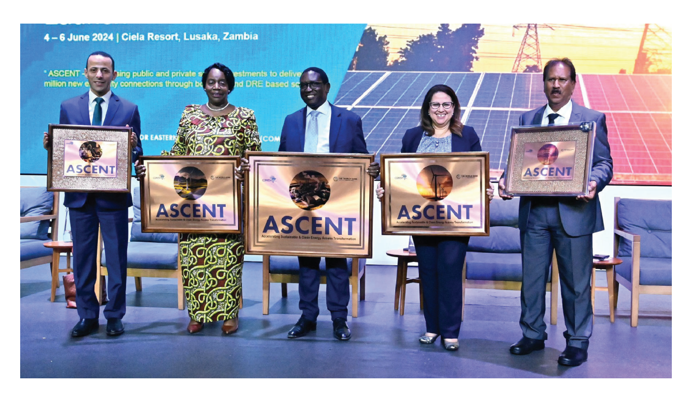
Symbolic launch of the Accelerating Sustainable and Clean Energy Access Transformation (ASCENT) programme by World Director of Regional Integration Africa, Middle East and North Africa H.E Ms. Boutheina Guermazi (2nd right) and SG Chileshe Mpundu Kapwepwe (2nd left) alongside Honourable Peter Kapala (middle), Minister of Energy of Zambia.