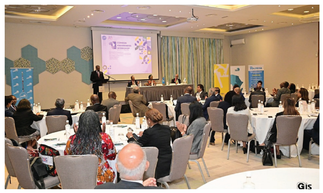
Delegates at the first-everCOMESA Institutions Awareness Forum