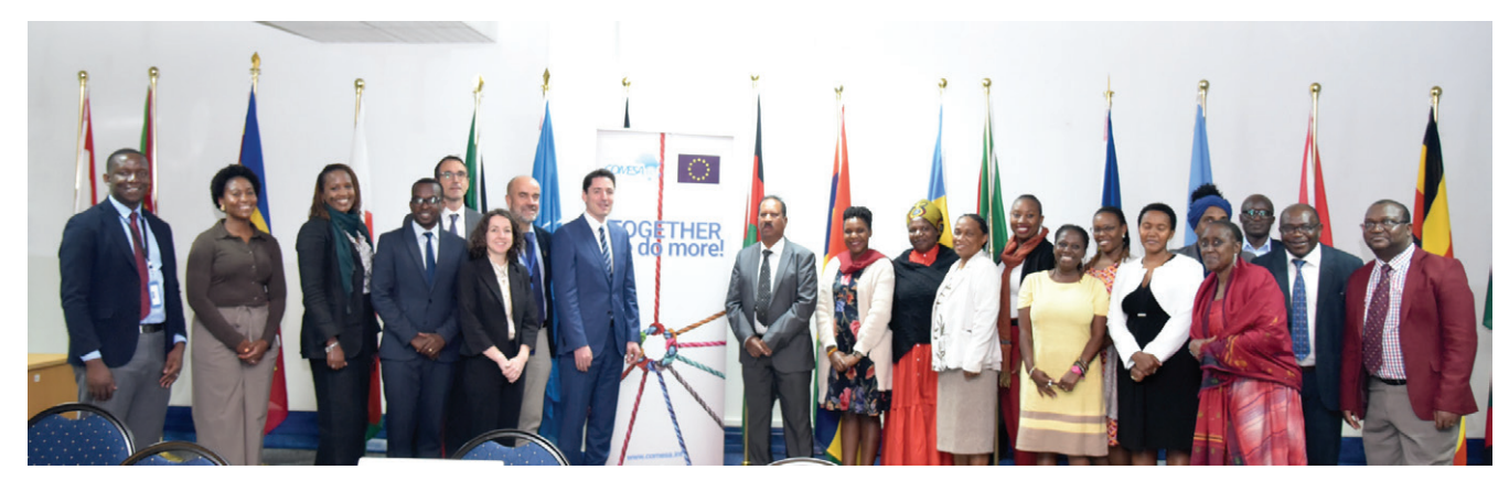
Officials from the EU Delegation with staff from COMESA Secretariat