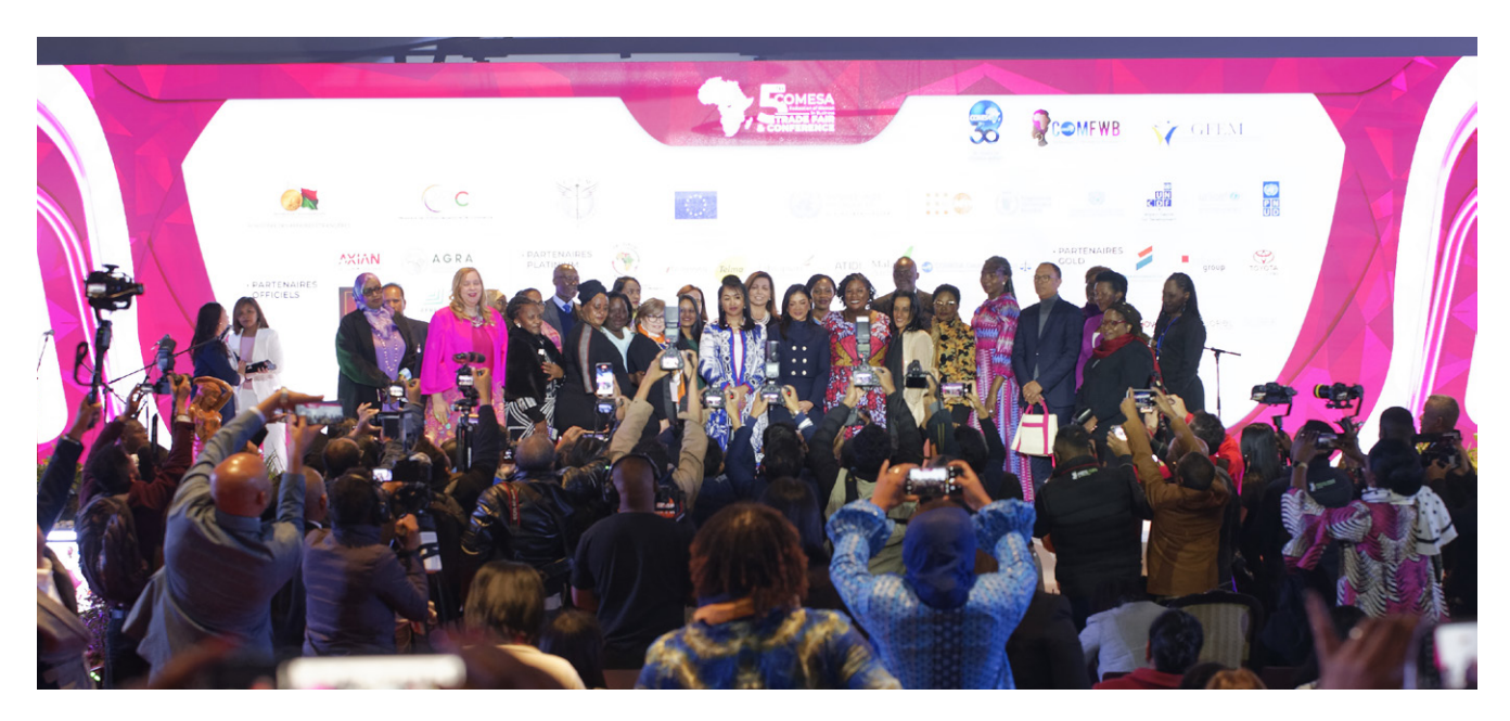
The 5th COMFWB Trade Fair was a success and attended by various stakeholders including VIPs, government officials, regional and international partners, the media and entrepreneurs