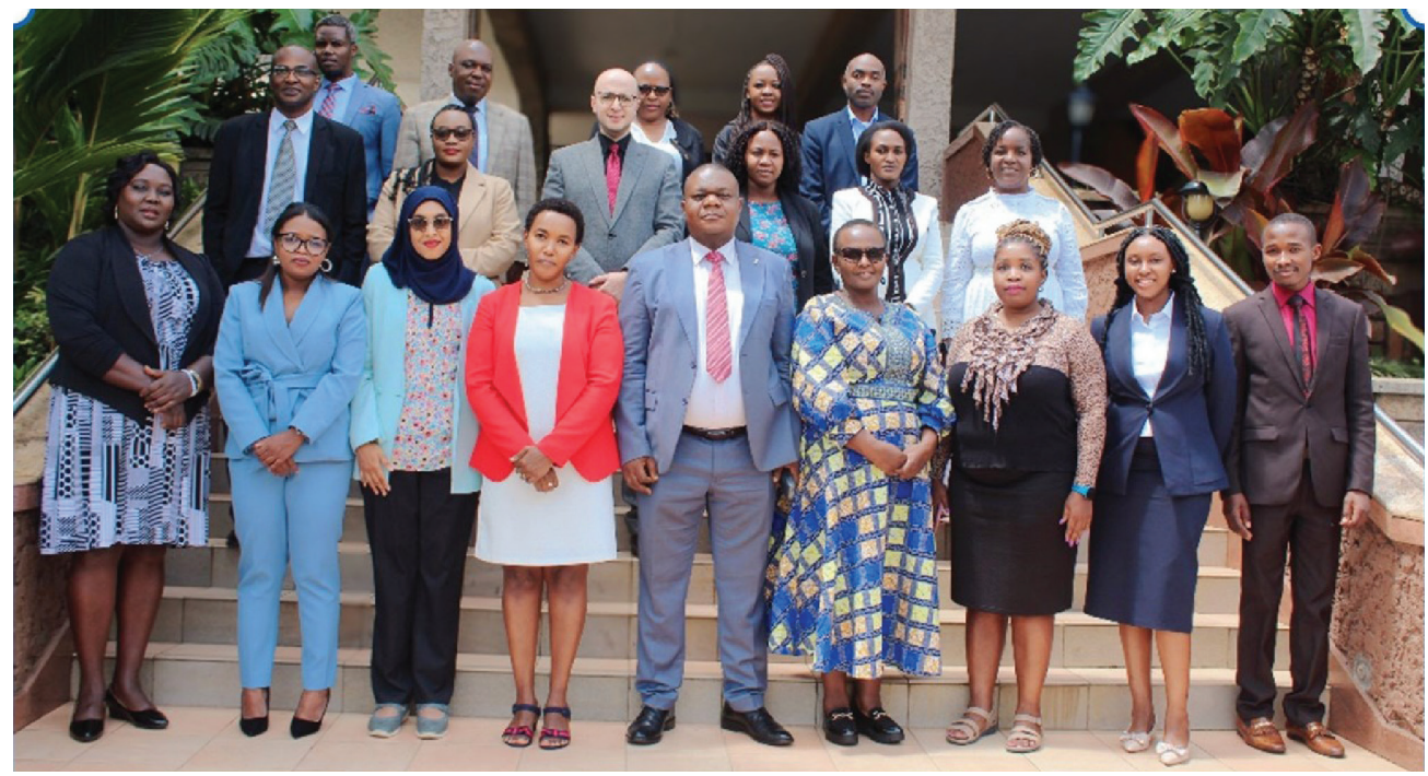
Delegates at the capacity building workshop for National Focal Points