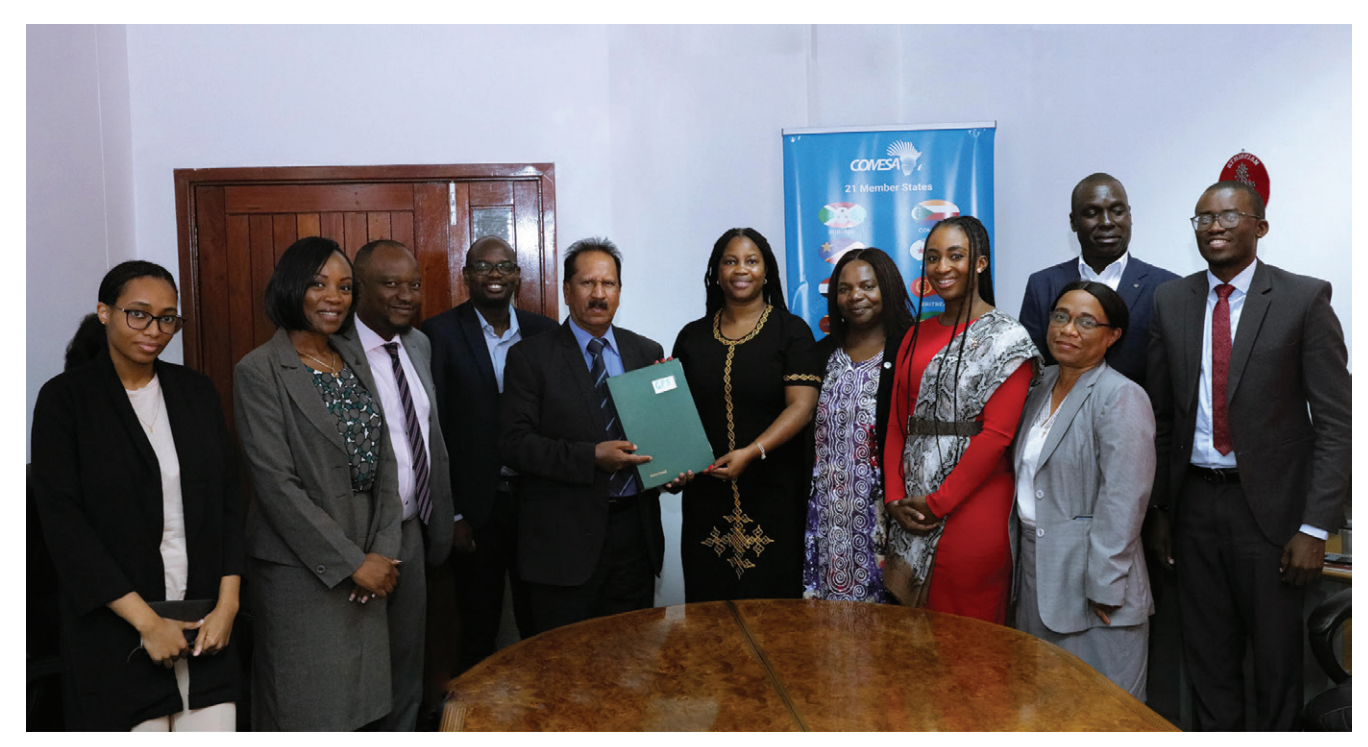
The COMESA and Centre for the Study of Violence and Reconciliation team signing MoU in Lusaka