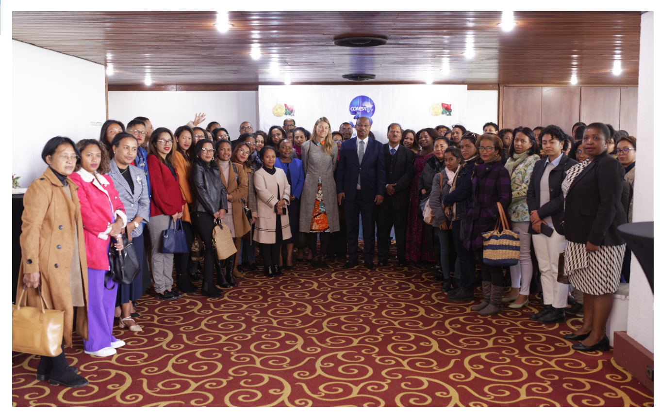
Participants at the Multi Stakeholders Meeting in Antananarivo, Madagascar