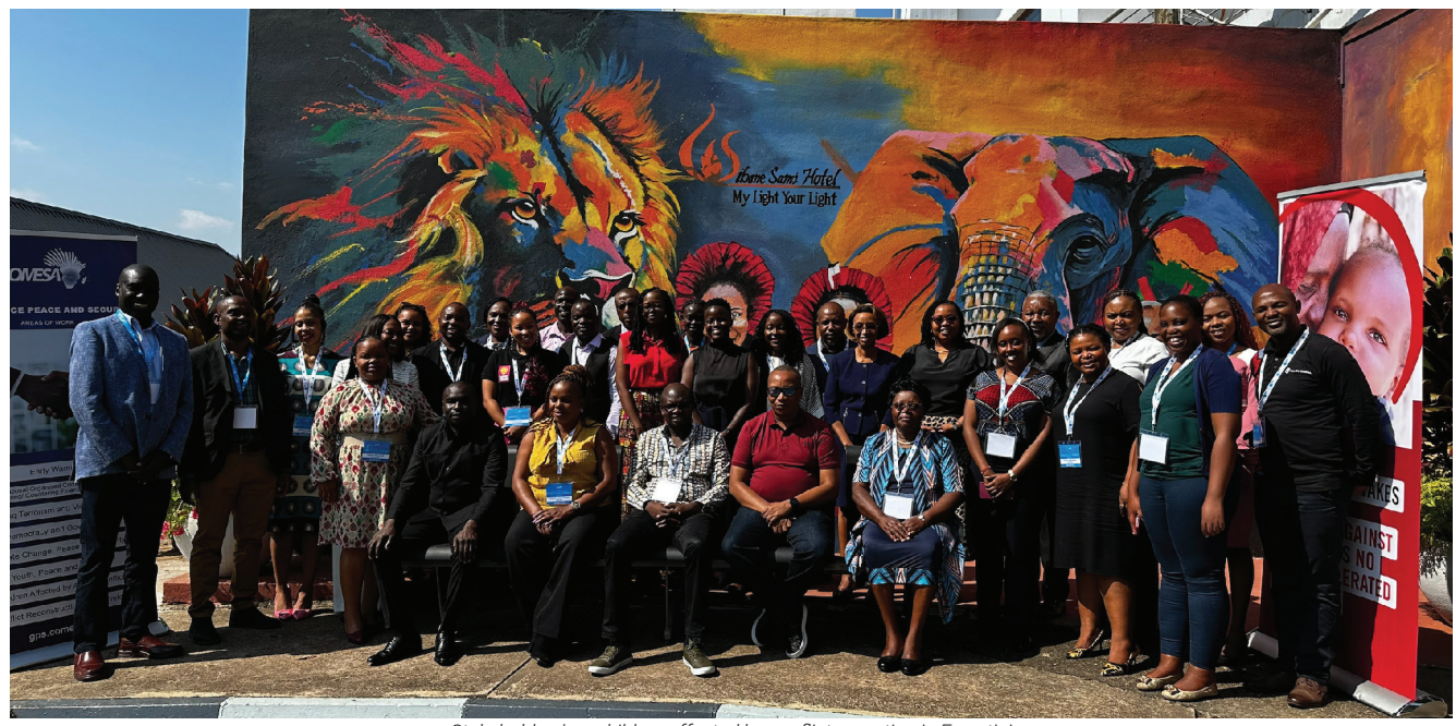
Stakeholders' on children affected by conflicts meeting in Eswatini

COMESA has partnered with Save the Children to conduct a comprehensive sensitization program in a proactive move towards addressing the plight of children affected by armed conflict (CAAC) in the COMESA region. This initiative is aimed at empowering Civil Society Organizations (CSOs) and National Human Rights Institutions (NHRIs) to champion the CAAC agenda effectively.