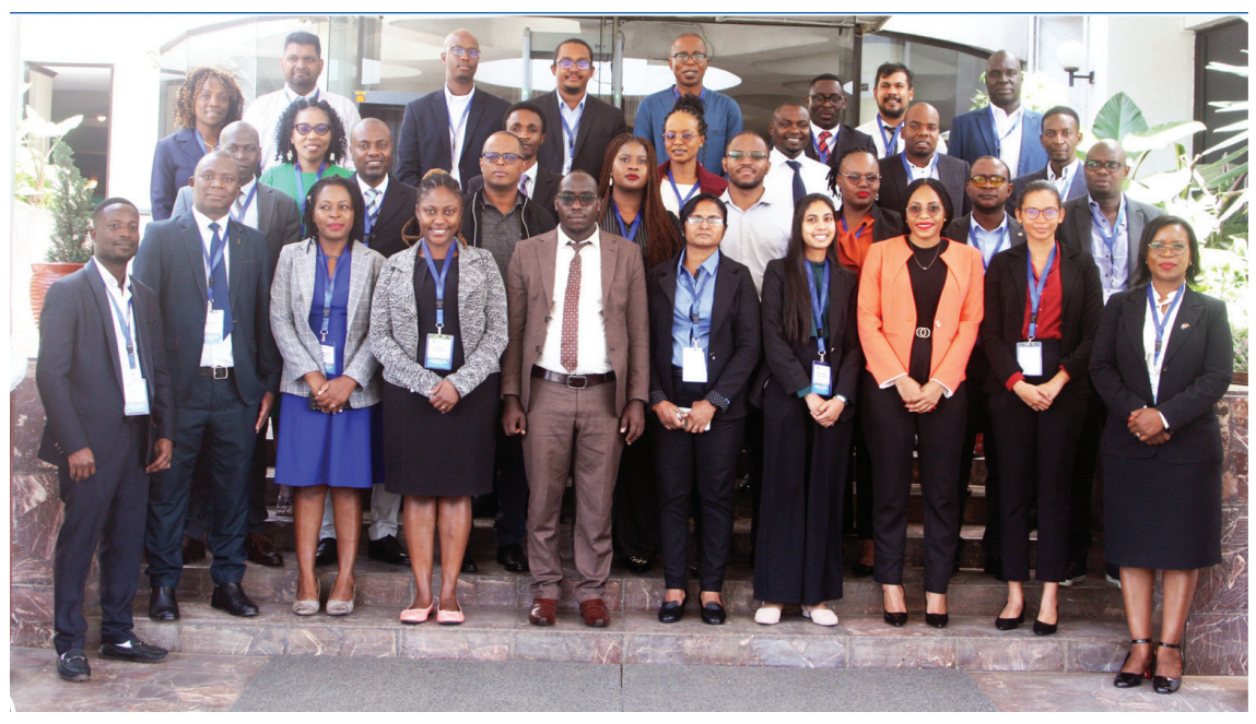
Financial Intelligence Units on strategic and operational effectiveness and financial intelligence held in Kenya 13 - 17 May 2024