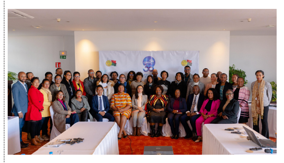
Madagascar journalists participating in the COMESA media sensitization forum in Antananarivo

As an agenda-setter for public discourse, the media significantly influences what the public considers important by how topics are communicated, framed, and emphasized. Therefore, to gain public traction on any topic, media engagement is essential.