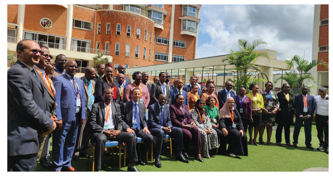
Stakeholders in sanitary and phytosanitary matters meeting in Nairobi, Kenya.