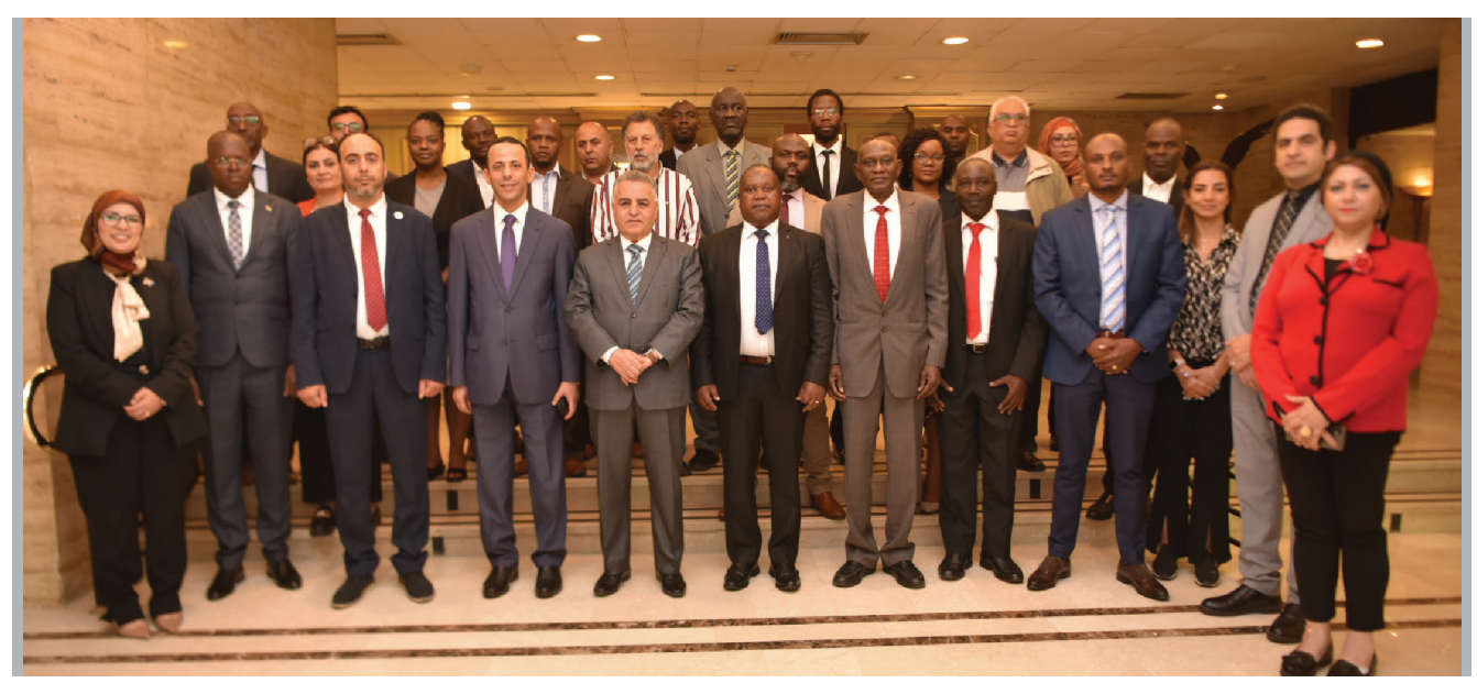
Delegates attending the 13th Annual General Meeting of the RAERESA

Thermal power dominates power generation in the COMESA region, accounting for more than 76 percent with hydro energy at 24 percent. This is out of the total installed power generation capacity estimated at 100,000 megawatts.