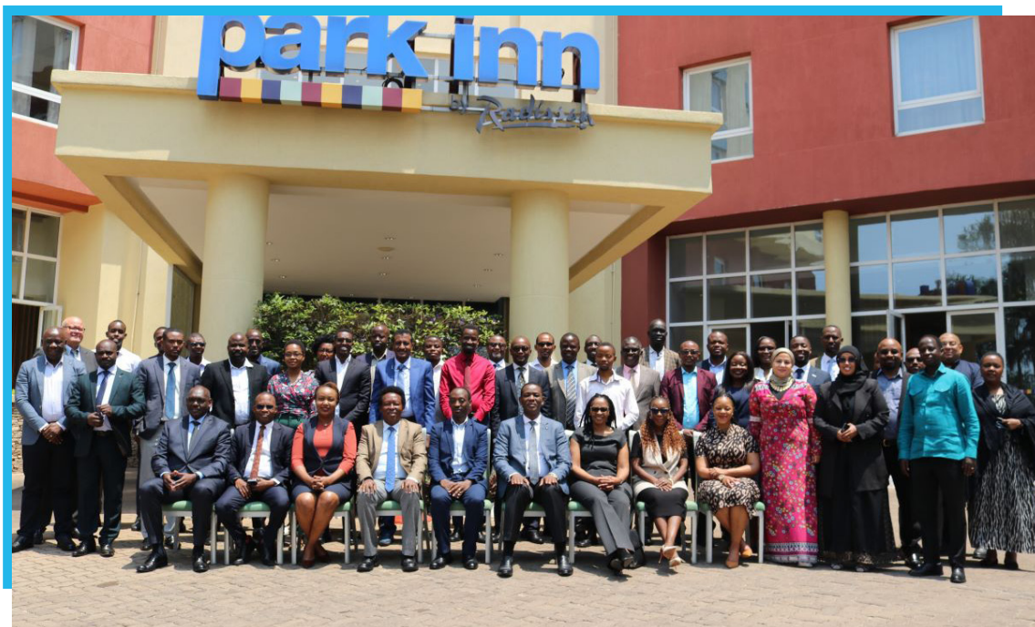
Participants at the Regional Workshop in Kigali

A regional capacity building workshop was successfully held in Kigali, Rwanda from 8 to 12 September for Member States on Annexes 3, 5 and 6 of the Yamoussoukro Decision (YD). These Annexes are detailed regulations and guidelines that elaborate on the YD's core principles for the liberalization of intra-African air transport markets, covering aspects such as competition, definitions of airlines and services, and procedures for commercial and operational flexibility.