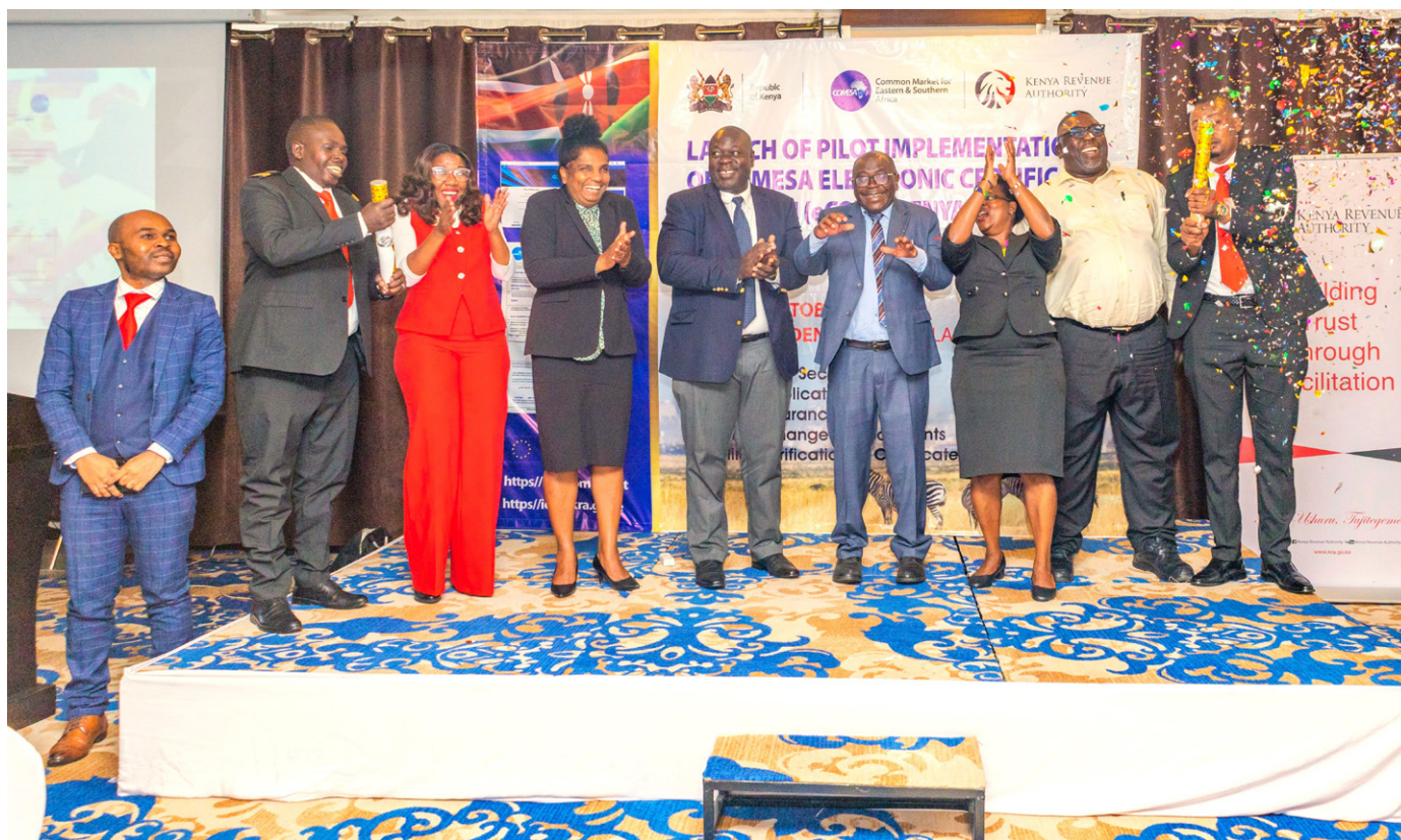
A milestone moment, as COMESA launches the Electronic Certificate of Origin (eCO) in Kenya