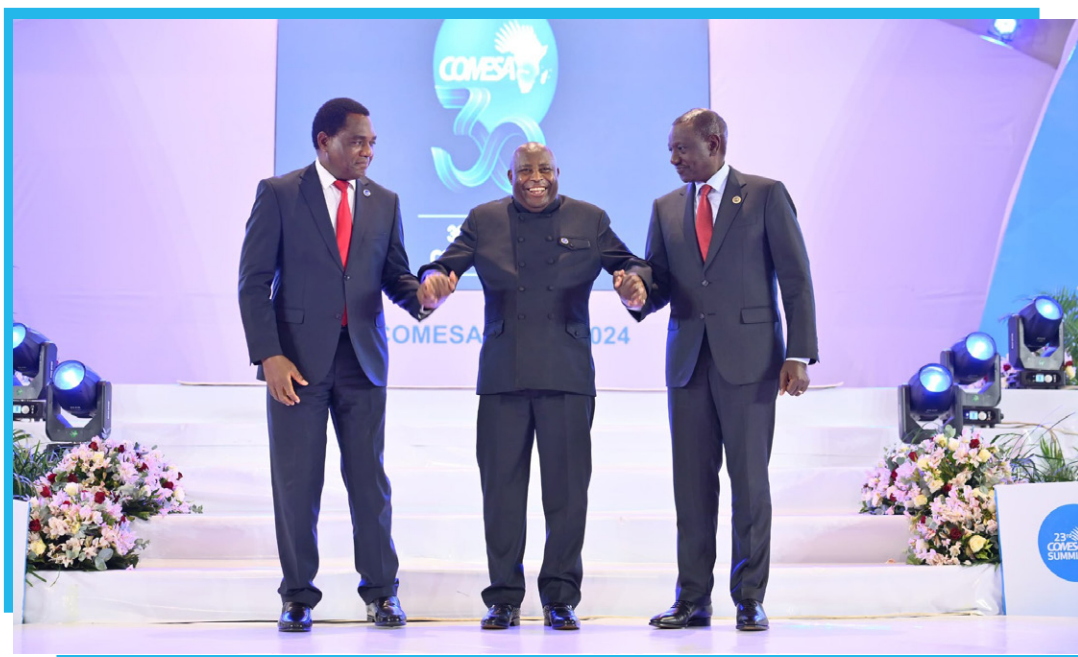
L-R: H.E Hakainde Hichilema, H.E Evariste Ndayishimiye and H.E William Ruto at the 2023 COMESA Summit in Bujumbura, Burundi

All is set for the COMESA Meetings scheduled for Nairobi, Kenya starting on Monday 6th – 9th October 2025.