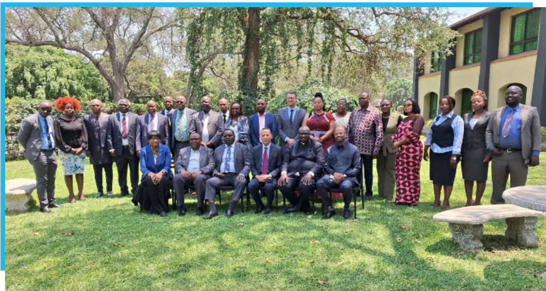
Participants at the High-Level Meeting of Permanent Secretaries on the CAIP in Livingstone, Zambia

Under their Joint Industrialization Programme, Zambia and Zimbabwe are set to strengthen their economic cooperation by establishing a Common Agro-Industrial Park (CAIP). This initiative aims to promote industrial development, increase intra-regional trade and enhance food security in the two countries.