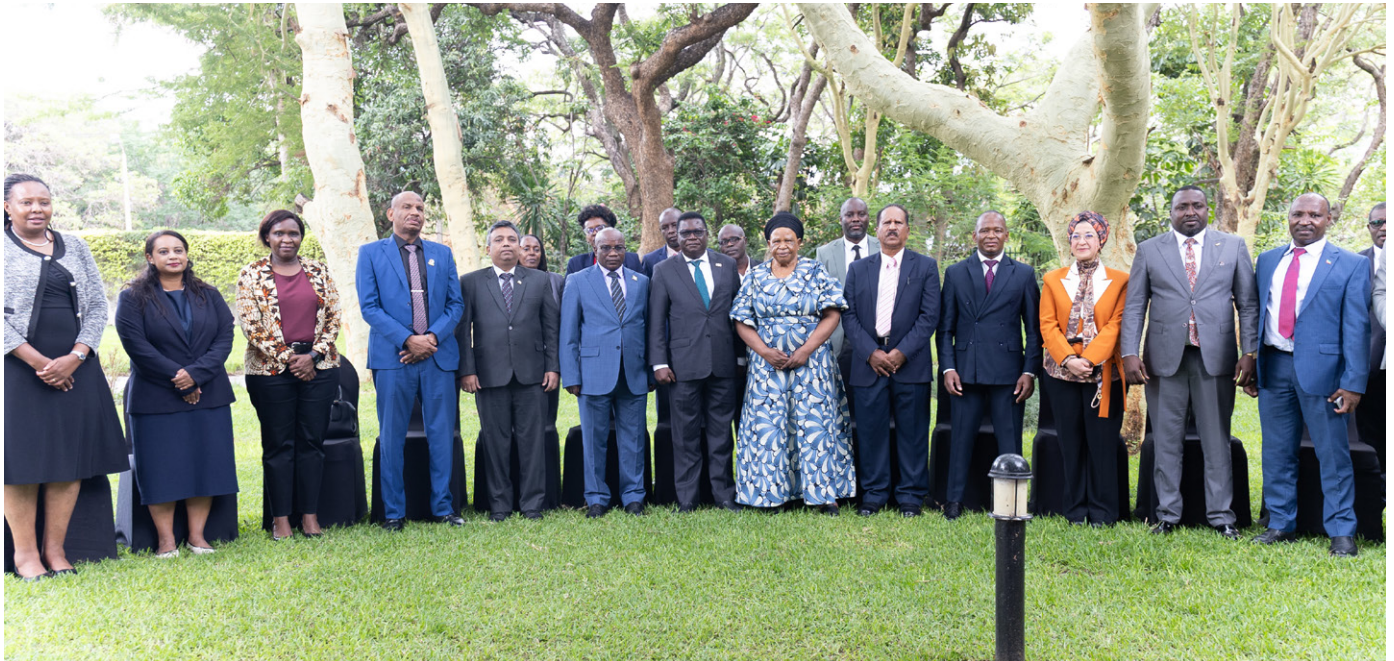
Delegates at the 28th meeting of the COMESA Ministers of Justice and Attorneys General in Lusaka, Zambia

Ministers of Justice and Attorneys General from the Common Market for Eastern and Southern Africa (COMESA) met in Lusaka on 14 November for their 28th meeting, following the 30th meeting of the COMESA Committee on Legal Affairs. The high-level discussions focused on reviewing key legal frameworks essential to regional integration and economic cooperation.